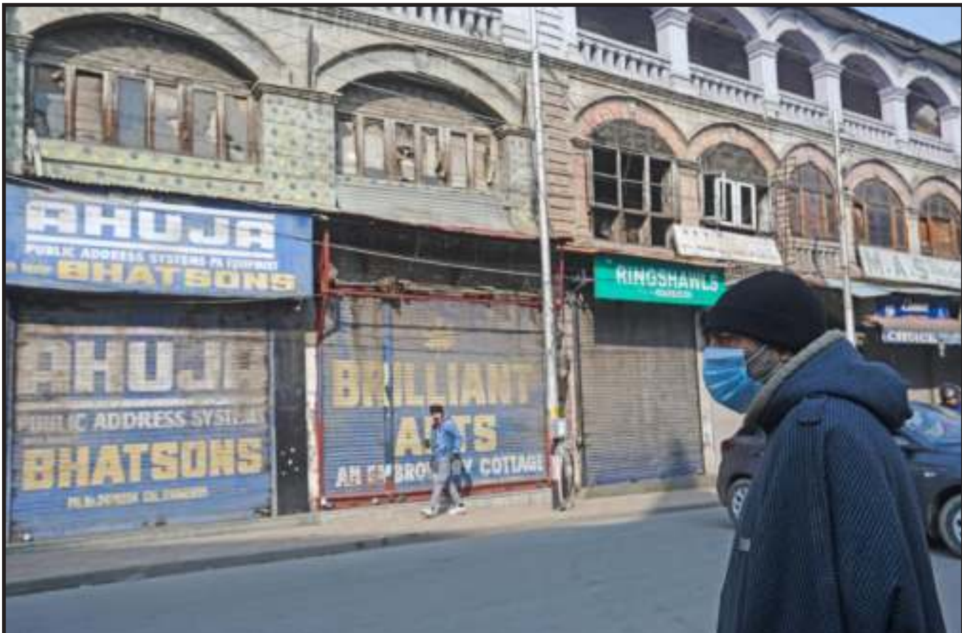
Amid increase in COVID-19 cases, the Jammu and Kashmir government on Saturday in order to prevent the virus from spreading has announced weekend lockdown in the Union Territory.