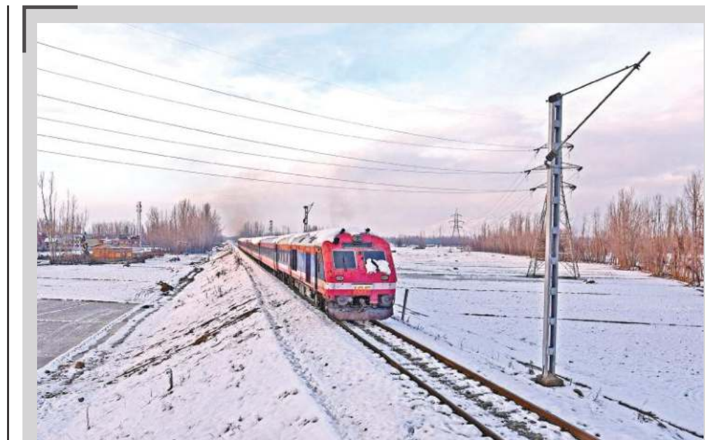
KOLENSMAN ABID BHAT captures a local train passing through snowfields in south Kashmir.

Similarly it is informed that R&B department has successfully cleared snow from roads of length 5339 KMs out of 5535KMs under its jurisdiction. The R&B has deployed 366 snow clearance machines during the recent