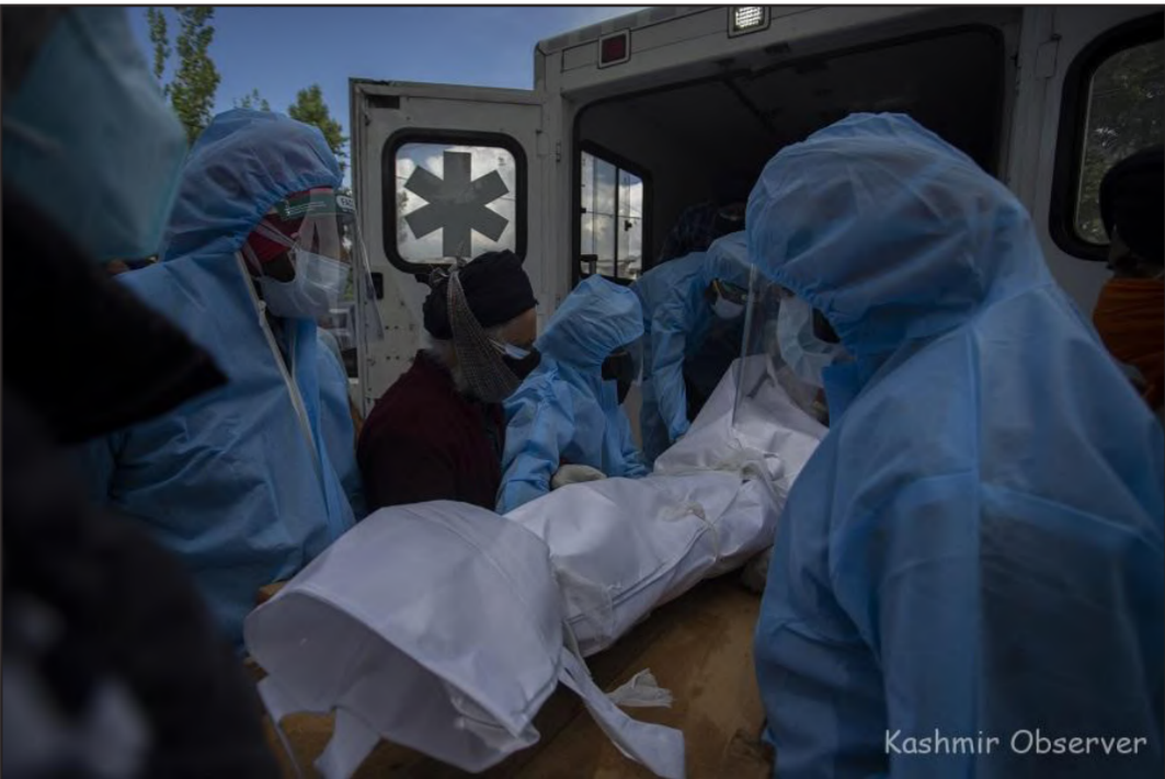
Over the past few months, most covid-19 related deaths have been in unvaccinated people. In November 2021, it was reported that around 67% of people who died of covid-19 were unvaccinated

However, as we know now, more and more each day, Vaccines work. Although they do not