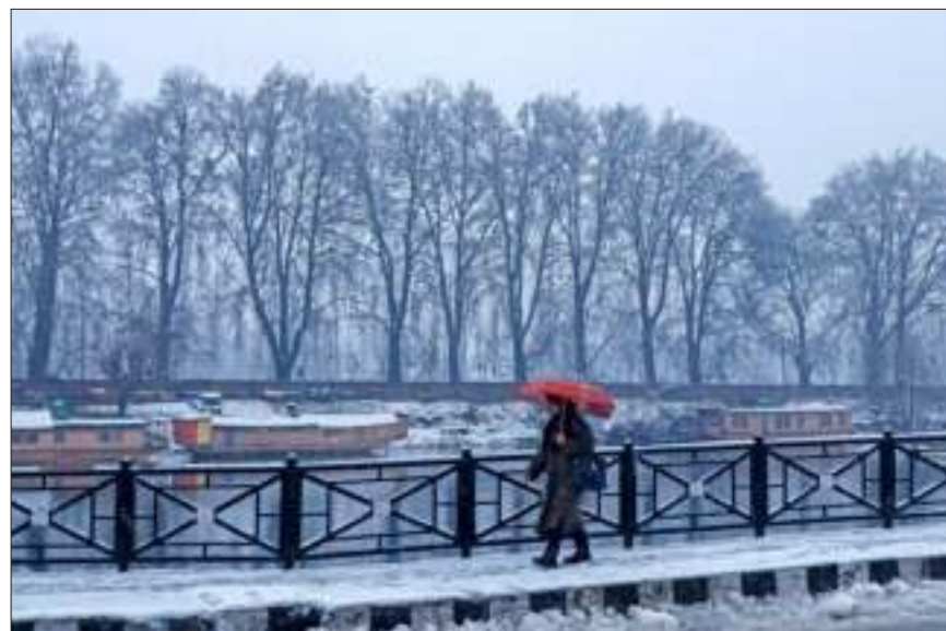
KO Photo: Abid Bhat