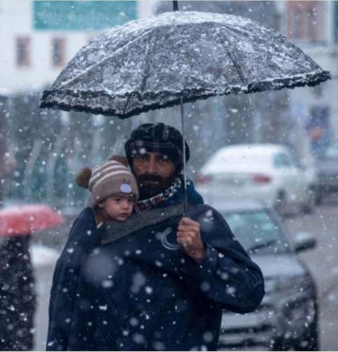
A KASHMIRI MAN CARRYING HIS CHILD INSIDE a traditional pheran as he walks along a street during heavy snowfall in Charar-e- Shareef Budgam.