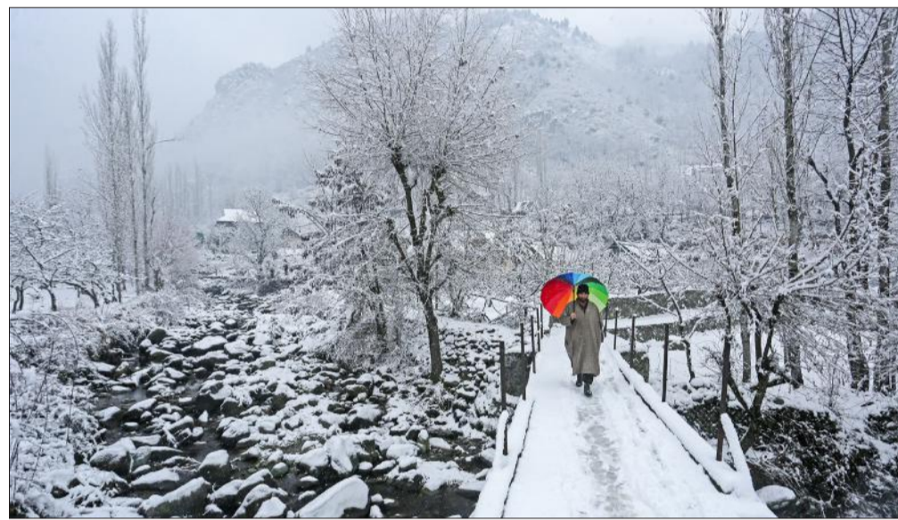
SRINAGAR WITNESSED THE SEASON'S FIRST SNOWFALL on Tuesday even as the weather department has predicted more rain and snow till Jan 9.