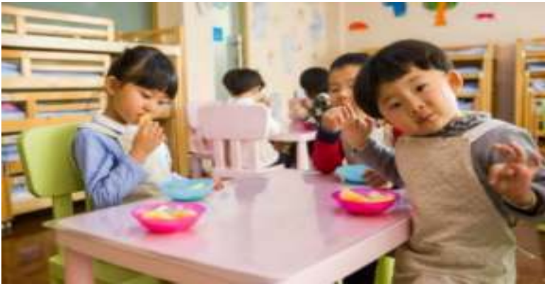
each other varied by location. To our surprise, children from rural