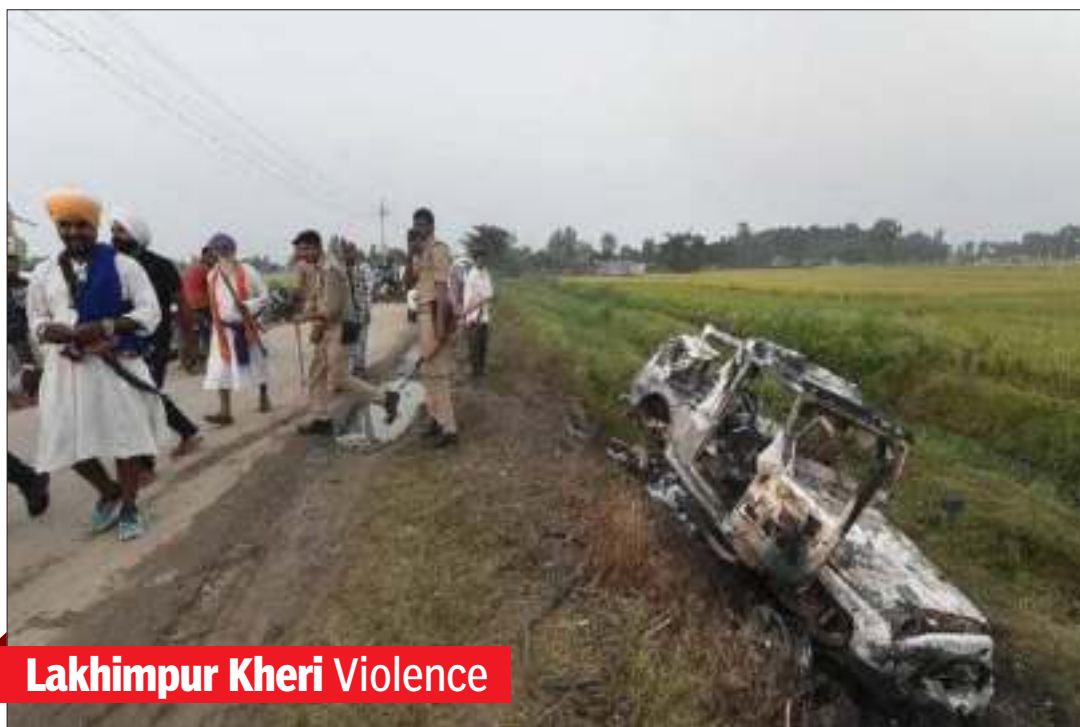
Lakhimpur Kheri Violence