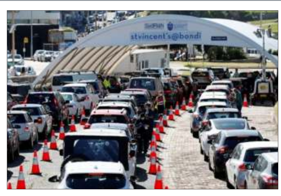
PEOPLE QUEUE AT A CORONAVIRUS TESTING clinic as the Omicron variant of the coronavirus continues to spread in Sydney, Australia, December 30.

10C) is being held. Pakistan Air ISLAMABAD: Pakistan has ac- fly-past of China's JS-10 (J-10C) aircraft in response to Rafale,"