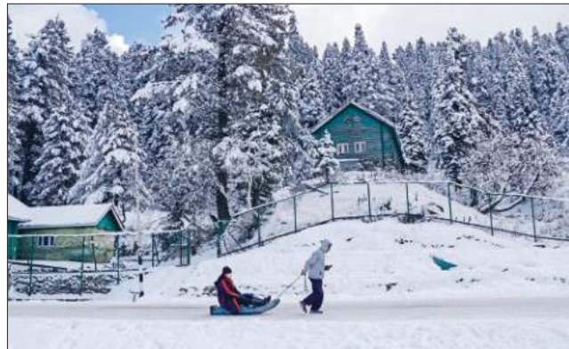
A tourist enjoying sledge ride in the skiing resort of Gulmarg after fresh snowfall