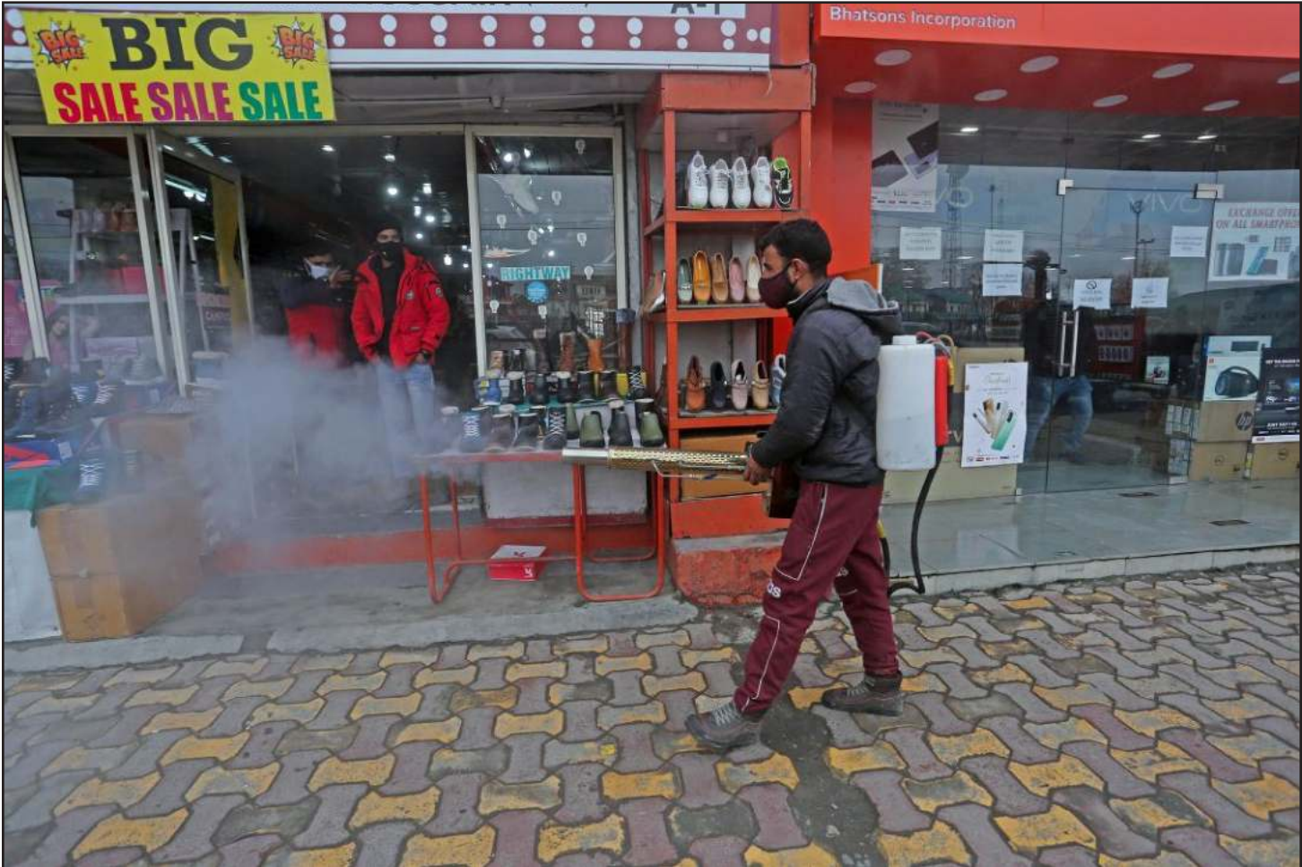
Amid 'Omicron' threat, employee of the Srinagar Municipal Corporation (SMC) sprays disinfectant at Residency Road in Srinagar

The Deputy Commissioner gave patient hearing to the delegation and assured all possible support from the District Administration Srinagar in ensuring smooth running of day to day affairs and management of all Gurdwaras in Srinagar City.