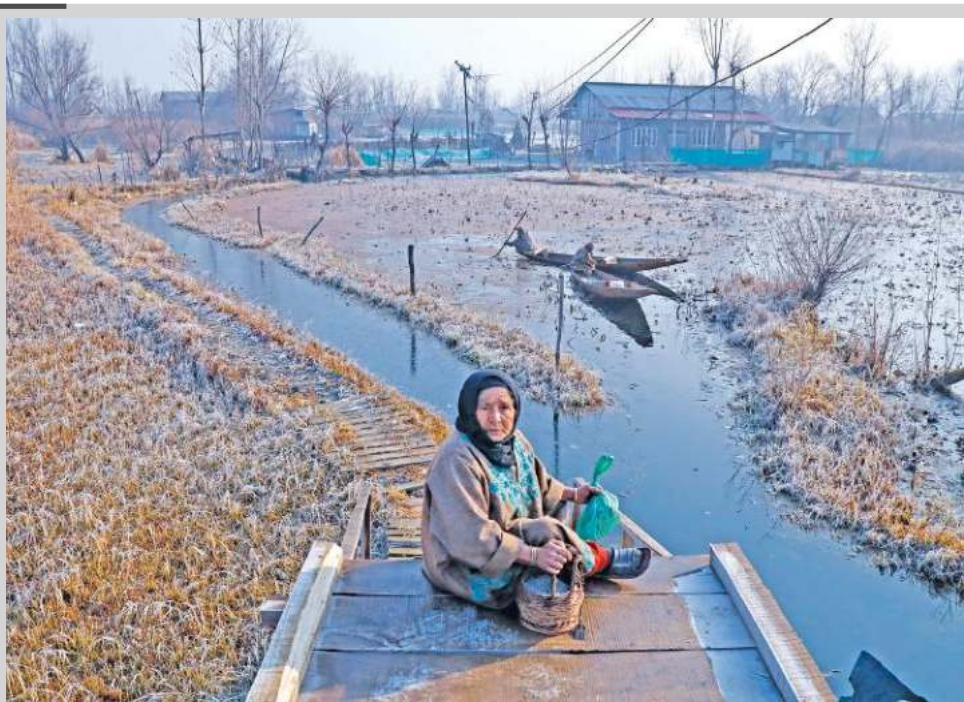
AN ELDERLY WOMAN waits on a wooden bridge for a boat to take her home in the interiors of Dal Lake