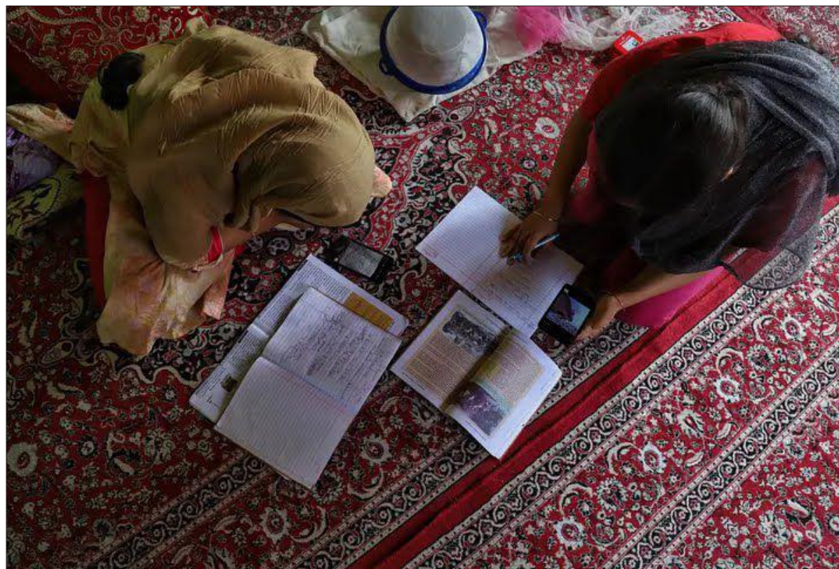
STUDENTS IN KASHMIR TAKE ZOOM CLASSES at their home in Sopore Town of district Baramulla, Jammu and Kashmir, on 29 June 2020.