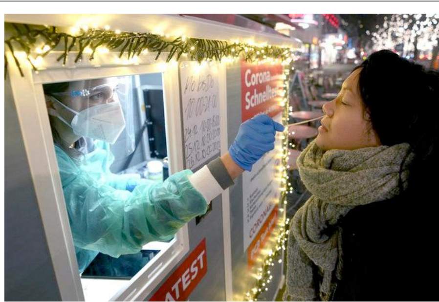
A HEALTH WORKER PERFORMS a coronavirus test at a shopping road in Berlin, Germany, on Dec. 21, 2021.

The ITI, by extension, will connect to China's Xinjiang autonomous region which is populated by ethnically Turkic Uighur Muslims and further boost BRI, a trillion-dollar plan to connect the infra-