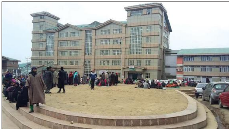
Every patient has to undergo RAT before entering the hospital for the treatment. As of now, 24 have tested positive and there will obviously be more in Casualty and other departments

On Tuesday, 104 new cases of the infection were recorded in Jam-