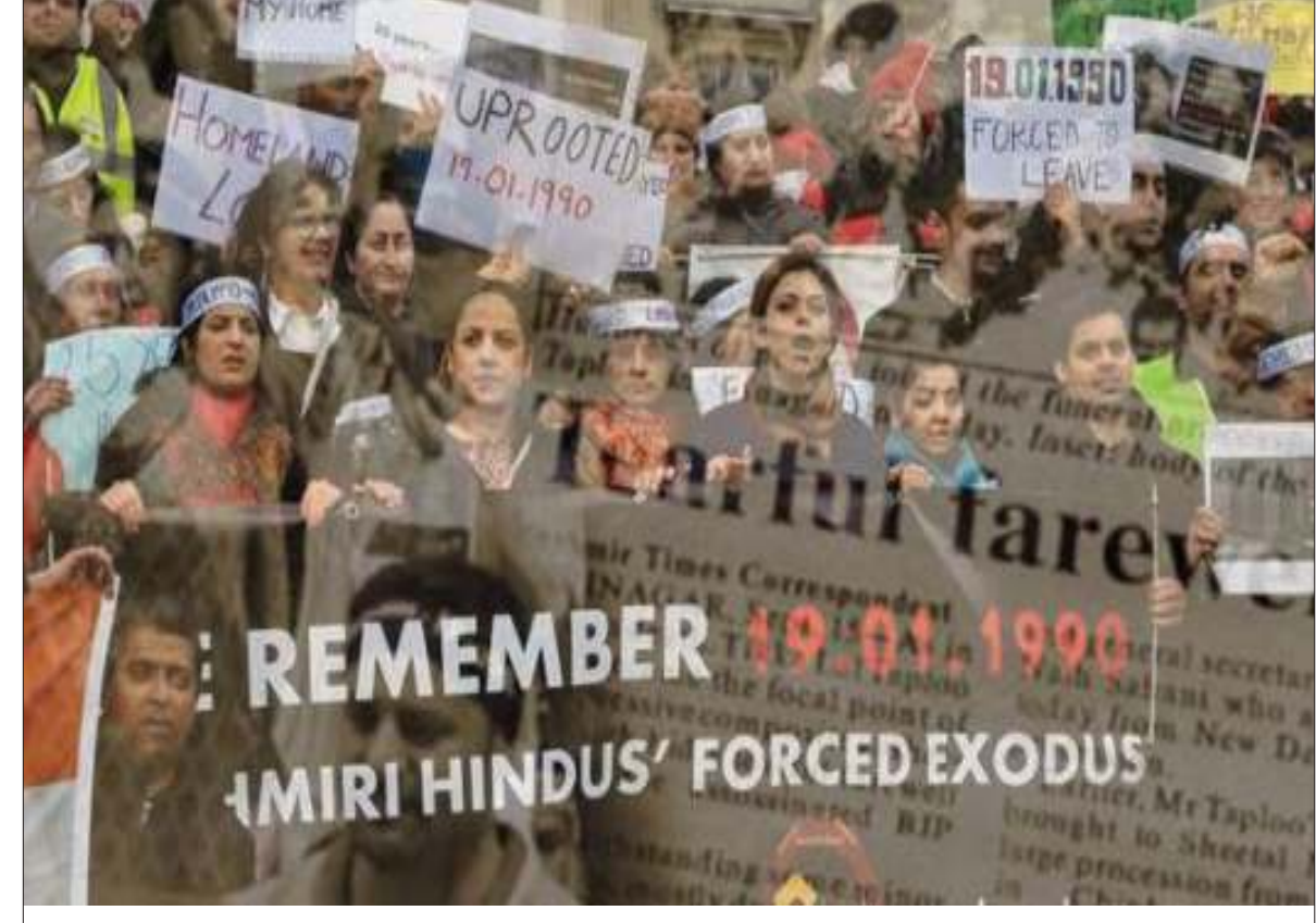
A PROTEST BY KASHMIRI PANDITS. For representational purposes only.

Pertinently, the information provided by J&K Police under RTI has revealed 1724 civilians were killed by militants in Kashmir in the past three decades. Out of these, more than 1600 were Muslims. However, nobody talks about those civilian deaths - reducing Kashmiri muslims in the hierarchy of human life and dignity.