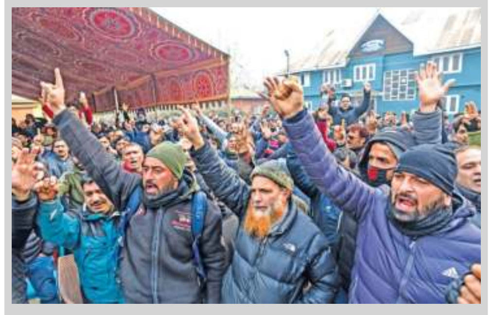
STRIKING PDD EMPLOYEES staged a protest at Bemina complex on Monday.

The figures reveal that till March-2020, the department of social welfare Kashmir has covpendency was 5540-(KNO)