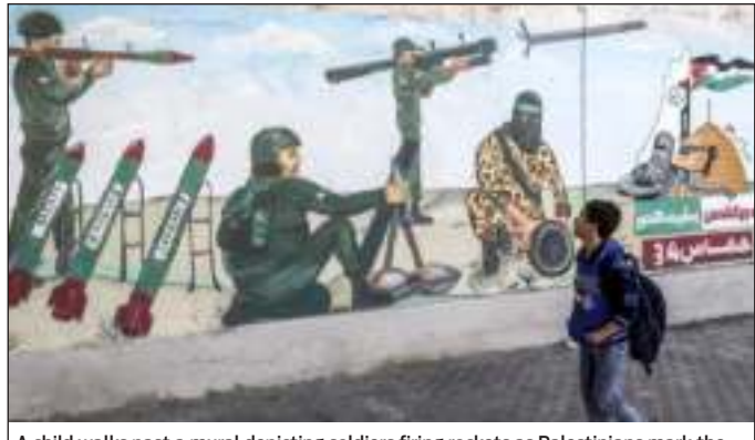
A child walks past a mural depicting soldiers firing rockets as Palestinians mark the 34th anniversary of the founding of the Palestinian resistance movement Hamas. which runs the Gaza Strip, on December 11, 2021.

Israel Fears 3,000 Missiles a Day in Case of War