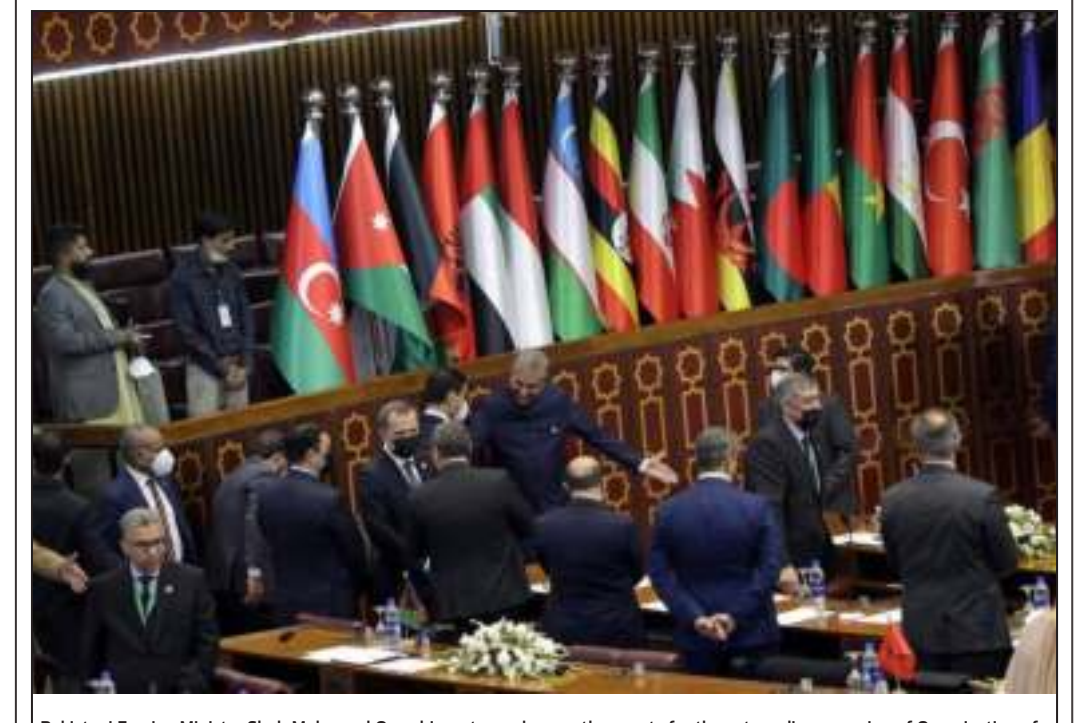
Pakistani Foreign Minister Shah Mahmood Oureshi, center, welcomes the guests for the extraordinary session of Organization of Islamic Cooperation (OIC) Council of Foreign Ministers, in Islamabad, Pakistan, Sunday, Dec. 19, 2021

ing Sunday's gathering that Δfσhanistan must not into a shelter for terrorist and extremist groups. The humanitarian crisis