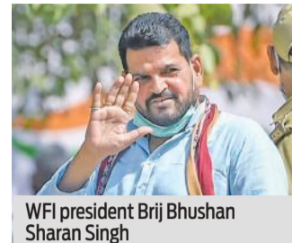
WFI president Brij Bhushan Sharan Singh

"The wrestler wanted a favour from the president that since he was from UP and also from his centre, he be allowed to compete but the president wants to root out age-related corruption from grassroots level, so he did not let