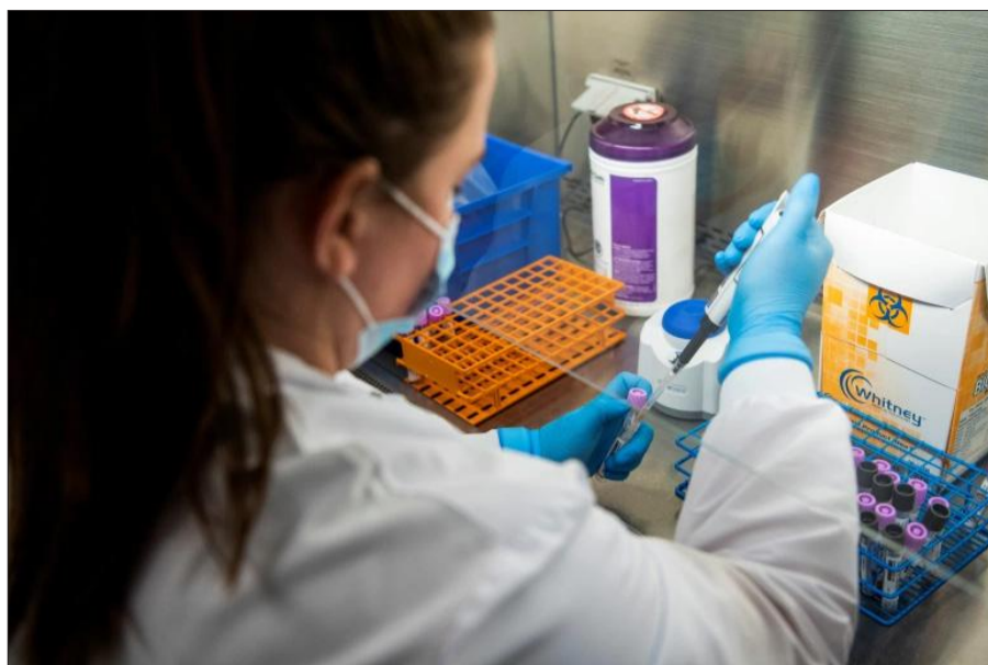
SCIENTISTS WARN OMICRON poses 'a major, imminent threat to public health'

Palestinians, along with most of the international community, consider settlements to be a major obstacle to peace.