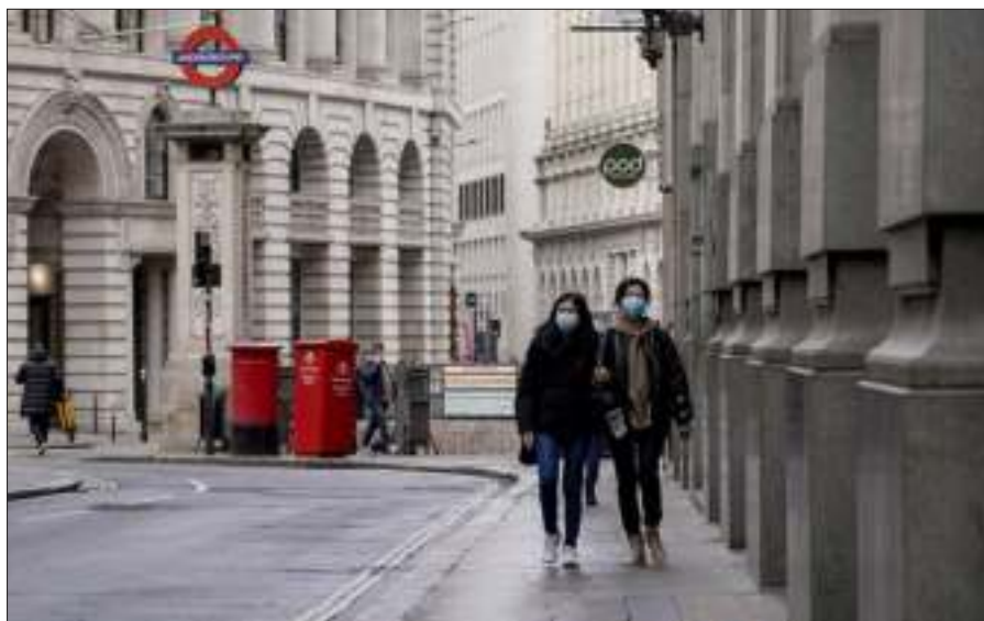
PEOPLE WEAR FACE MASKS while walking in an empty street in the financial district, known as The City, in London, Monday, Dec 13.

Congress general secretary Priyanka Gandhi Vadra also demanded that there should be an inquiry into the role of the minister of state for home in the "conspiracy" "Due to the court's rebuke and because of 'satyagraha', now even the police is saying that the son of the minister of state for home had conspired and crushed farmers. But @narendramodi ji, due to anti-farmer mindset, you have not even removed him from his post," she said.