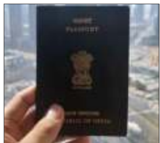
Asian News International

NEW DELHI: A total 8,81,254 Indian citizens renounced their citizenship in the last seven years till September 30, 2021 as per information available with the Ministry of External Affairs, Minister of State for Home Affairs Nityanand Rai informed Lok Sabha on Tuesday.