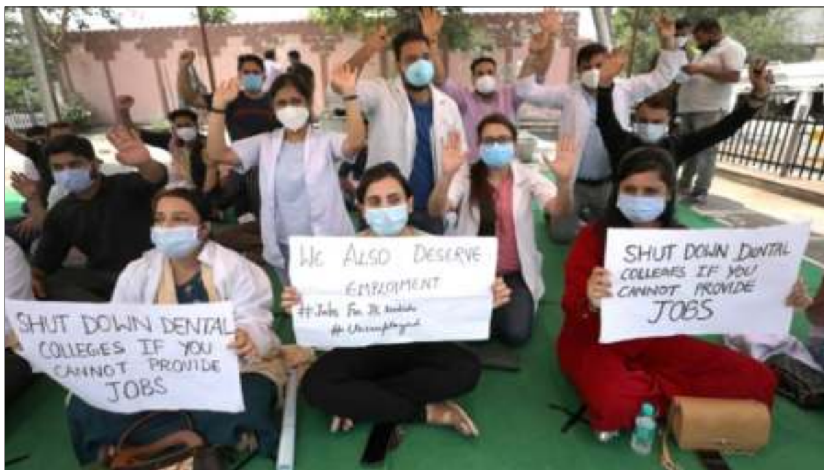
DENTISTS PROTESTING the lack of Government jobs in J&K, earlier this year