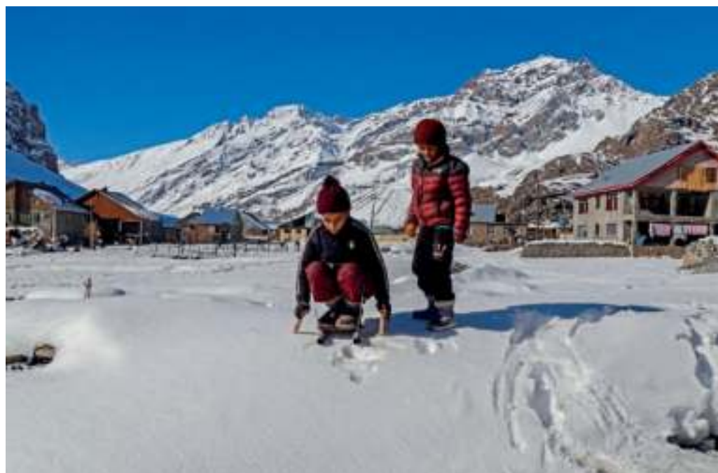
Children enjoying sledge ride on a bright sunny day in the snowbound Drass Valley of Kargil.

The setting up of J&KARA has come on the heels of a recent investigative report alleging illegal "adoption and sale" of children orphaned by Covid in Kashmir. "That report has been an eye-opener as the reality unearthed by it has More on P10