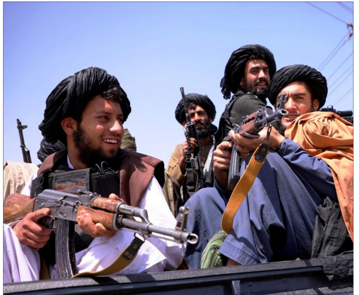
Taliban forces patrolling in front of the Hamid Karzai International Airport in Kabul, Afghanistan on September 2, 2021

Afghanistan is enviably located between South, West, and Central Asia. It can serve as an energy and trade and transit corridor and connect the energy rich Central Asian states to the rapidly emerging economies of India, Pakistan, and Bangladesh.