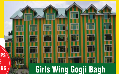
Girls Wing Gogji Bagh

SCHOLARSHIPS AVAILABLE FOR DESERVING STUDENTS