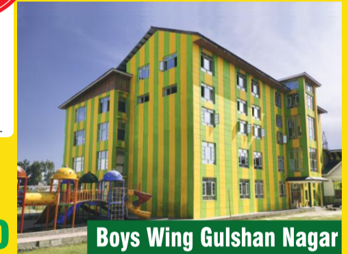
Boys Wing Gulshan Nagar