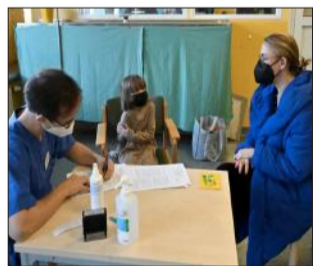
for older children in May.

The European Medicines Agency (EMA) approved the use of Pfizer-BioNTech's lower-dose vaccine on the 5-11 age group last month, following the go-ahead