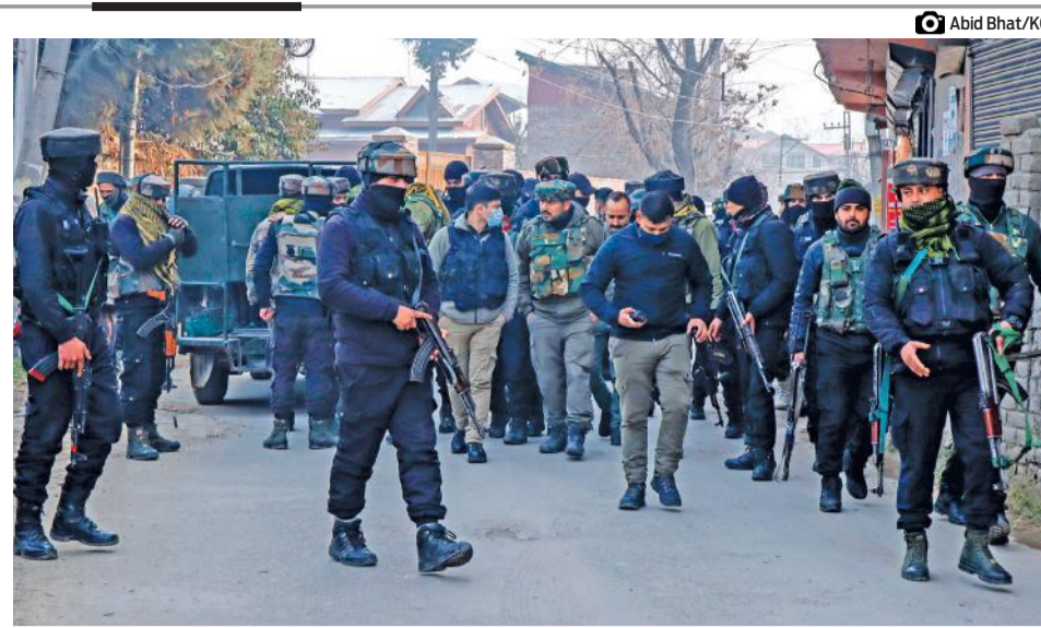
SECURITY PERSONNEL leaving Rangreth area of city outskirts after killing two militants in a 'chance' encounter.

A change in the composition of the civil services after disbanding J&K cadre has only deepened the administrative inertia in the region.