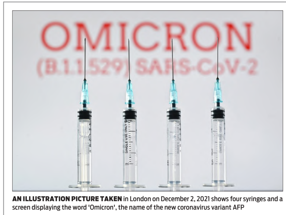
AN ILLUSTRATION PICTURE TAKEN in London on December 2, 2021 shows four syringes and a screen displaying the word 'Omicron', the name of the new coronavirus variant

While Bennett is the first Israeli prime minister to visit the UAE, Foreign Minister Yair Lapid made a landmark trip in June, opening an embassy in Abu Dhabi and a consulate in Dubai.