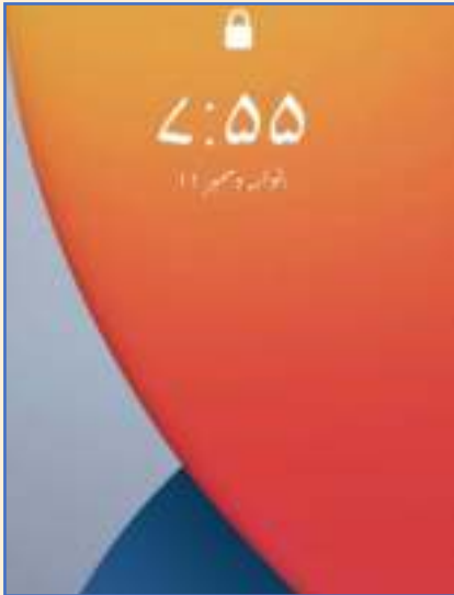
Kashmiri Language. If this helped you. Do share snaps of your lockscreen with us on KO's Socials.