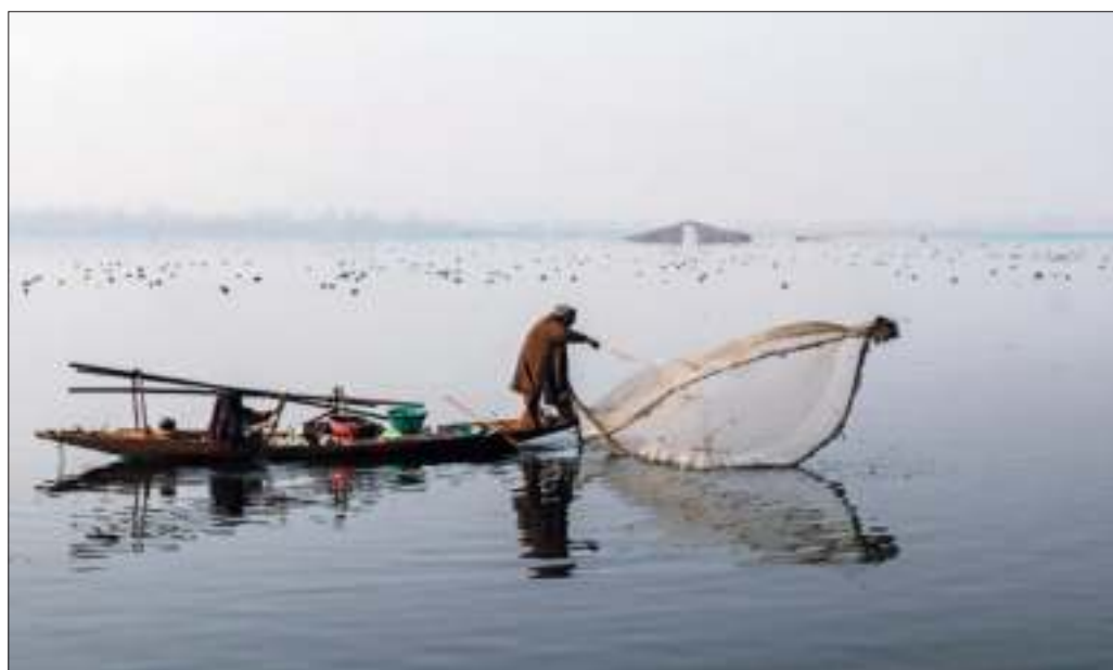
A fisherman casts his net on a cold Friday afternoon inside Srinagar's Dal Lake.