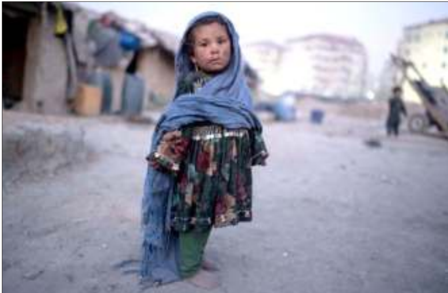
A CHILD STANDS OUTSIDE HER HOME in a neighbourhood where many internally displaced people have been living for years, in Kabul, Afghanistan, Dec 7.

In August, a court sentenced six religious extremists to death for the brutal murders of two gay rights activists.