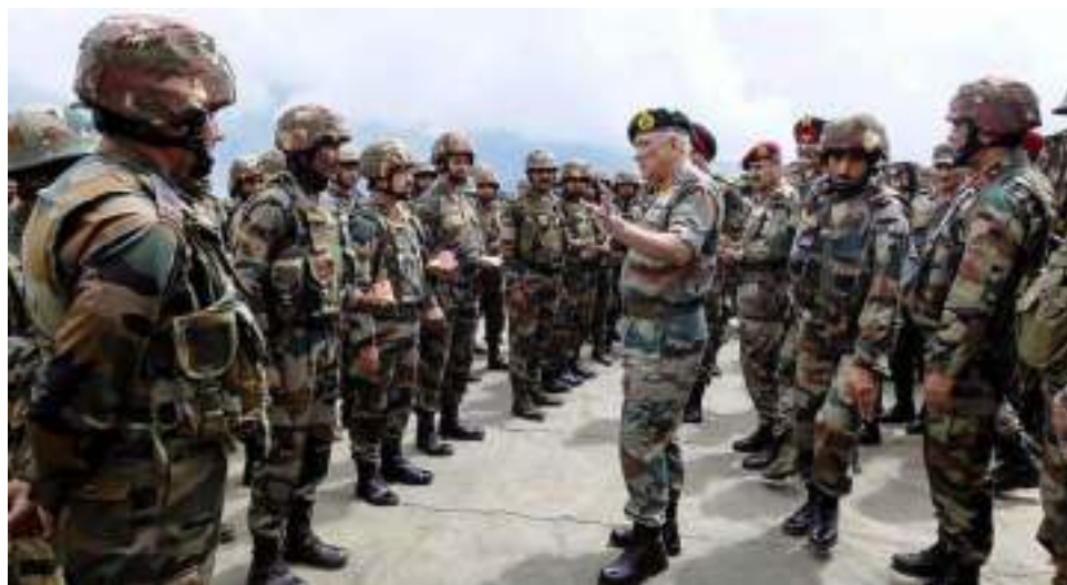
Army Chief General Bipin Rawat interacting with the troops in a file photo.

The total financial implication for the remaining construction stands at Rs 1,98,581 crore, the spokesperson said on Twitter. PTI