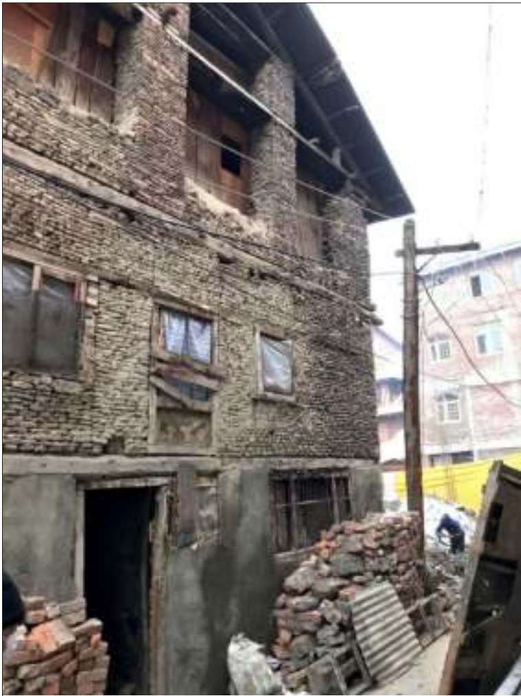
PHOTO OF WIRES PRECARIOUSLY held by a wooden pole in DOWNTOWN, Srinagar. Over the years, winters have always brought with them electricity woes and the early arrival of increased scheduled power cuts has only made the fears of yet another tough winter, more concrete.