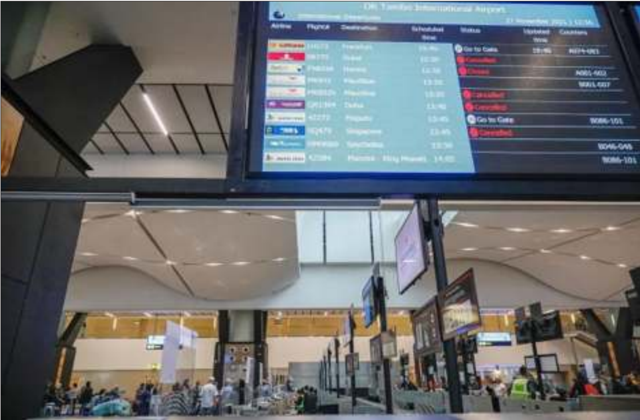
What not to do: ban travel. Scenes at South Africa's OR Tambo International airport after the first flight bans were announced.

Secondly, don't have domestic (or international) travel bans. The virus will disseminate irrespective of this – as has been the case in the past. It's naive to believe that imposing travel bans on a handful of countries will stop the import of a variant. This virus will disperse across the globe unless you are an island nation that shuts off the rest of the world. The absence of reporting of the vari-