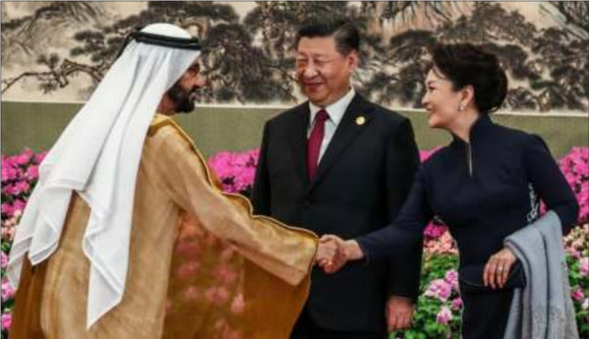
MOHAMMED BIN RASHID AL MAKTOUM, vice president and prime minister of the United Arab Emirates, ruler of the Emirate of Dubai, China's President Xi Jinping and his wife Peng Liyuan (L-R) ahead of a reception marking the Belt and Road Forum at the National Museum of China on April 26, 2019 in Beijing.

The Aggressive And Planned Manner In Which Chinese Companies Have Forayed Globally, Poses A Risk Not Just To The Economic Interests But Also The Defence Interests Of The Collaborating And Neighbour Nations