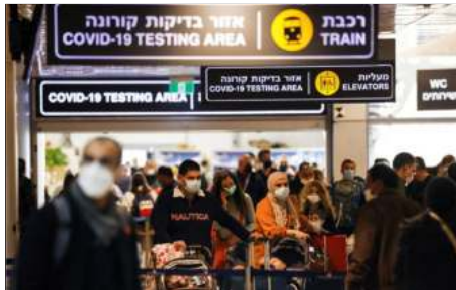
TRAVELLERS EXIT THE CORONAVIRUS DISEASE (COVID-19) pandemic testing area at Ben Gurion International Airport as Israel imposes new restrictions near Tel Aviv, Israel November 28, 2021

Khatibzadeh, asked about the visit, said: "Good talks took place at different levels. These talks remained unfinished because we did not reach agreement on some words and concepts that are important to both sides, but the terms of the agreement were almost finalized."