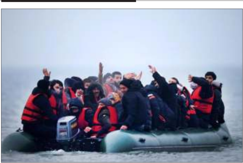
FRANCE SAYS SOME 31,500 migrants have attempted to leave for Britain since the start of the year and 7,800 people have been rescued at sea. (Ihlas Haber Ajansi)

Blasphemy is a sensitive subject in Pakistan, where strict blasphemy laws prescribe a mandatory death penalty for certain forms of the crime. The four men were charged under sections 295 and 298 of Pakistan's penal code, which carry penalties of up to two years in prison. Pakistan has never executed a convict under the blasphemy laws, but accusations of the offence have increasingly led to murder by mobs or individuals. Since 1990, at least 79 people have been killed in such violence, according to an Al Jazeera tally. Pakistani human rights activists have decried the case against the four men as being unfounded. "If there was a Muslim who in good faith wants to have an announcement such as this made in the community, it's not an attack on someone's faith, it's a good cause," said human rights activist and lawyer Nadeem Anthony. "So if someone announces [a funeral] on a loudspeaker, how is it a religious violation?"