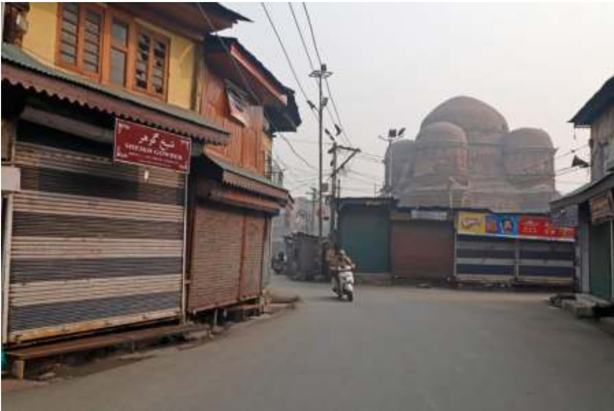
Many markets in Downtown Srinagar remained shut on Thursday, a day after the killing of Mehran Yasin of Jamalatta.