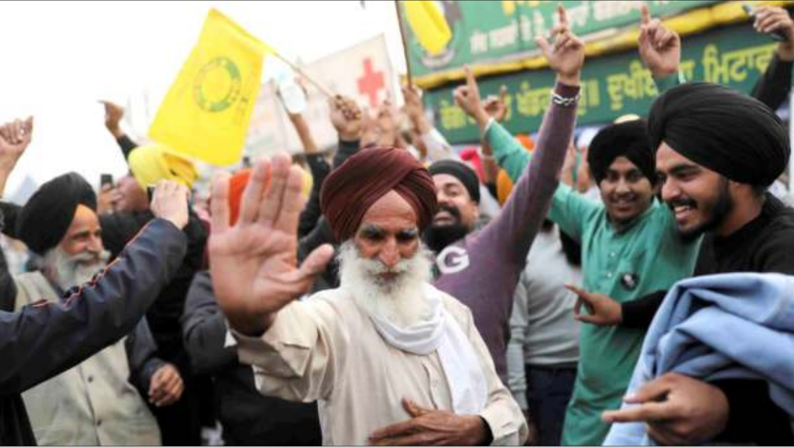
Farmers celebrate after Prime Minister Narendra Modi announced that he will repeal the controversial farm laws near the Delhi-Haryana border, India, Nov. 19.

How India's Farmers Took On Its Most Powerful Political Party