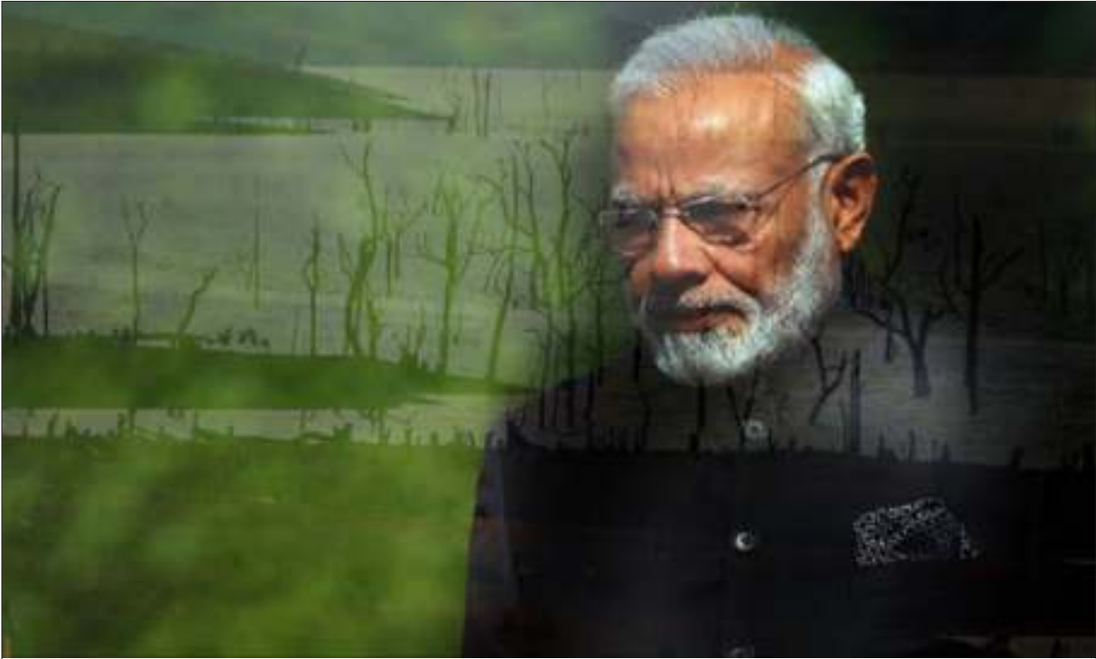
THE PROGRESSIVE ANNOUNCEMENTS of Modi that were welcomed then, now stand in stark contrast to India's last-minute intervention to water down the use of coal and bypassing the global methane pledge which was launched during COP 26 summit