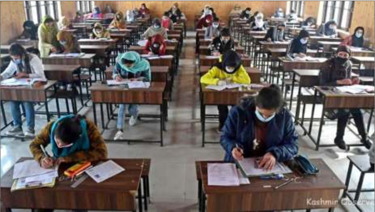
For Representational Purposes Only | File Pic

EXAM BOARDS COULD MAKE GREATER USE OF RUBRIC-BASED ASSESSMENTS, which consider myriad components of a student's work, including written, oral and visual. Giving a higher priority to project-based learning can encourage students to find ways to solve real-world problems