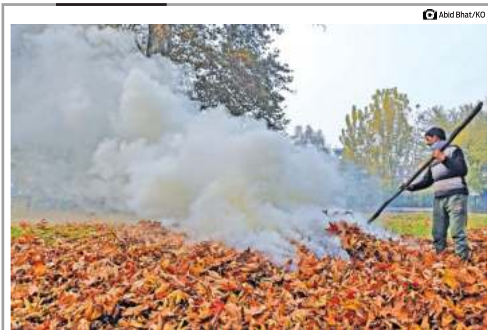
A MAN BURNS FALLEN CHINARA tree leaves to make charcoal, which is used by people for heating in harsh winters.