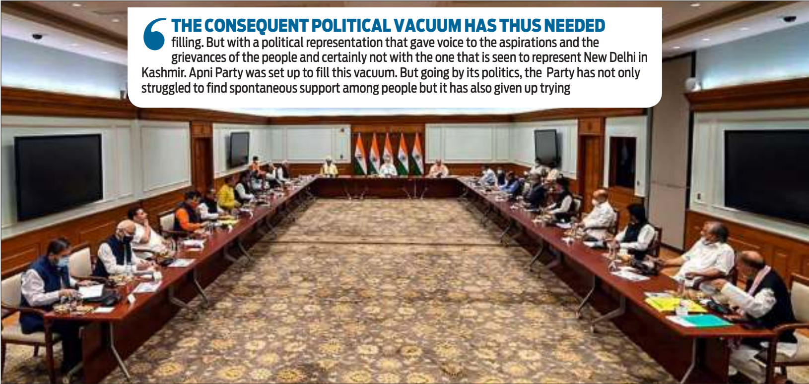
PRIME MINISTER NARENDRA MODI chairs an during a meeting with various political leaders from Jammu and Kashmir in New Delhi on June 24, 2021.

As Important As It Is To Acknowledge That Politics Has Very Little Room In The Current Situation, There Is Also A Lack Of Will On The Part Of Political Parties To Engage In Politics