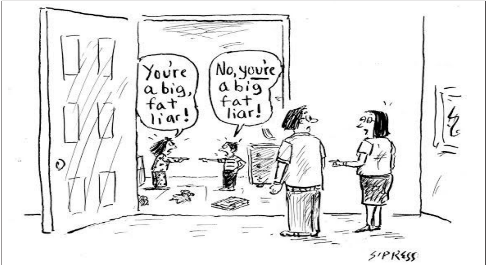
AGREEING TO DISAGREE? Showing empathy or compassion about why someone holds opinions very different from yours can help defuse polarization.