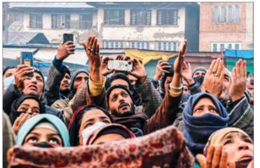
Congregational prayers were held in Khanyar, Srinagar on Wednesday to observe the Urs of Sheikh Abdul Qadir Jeelani, popularly known as Dastgeer Sahib.