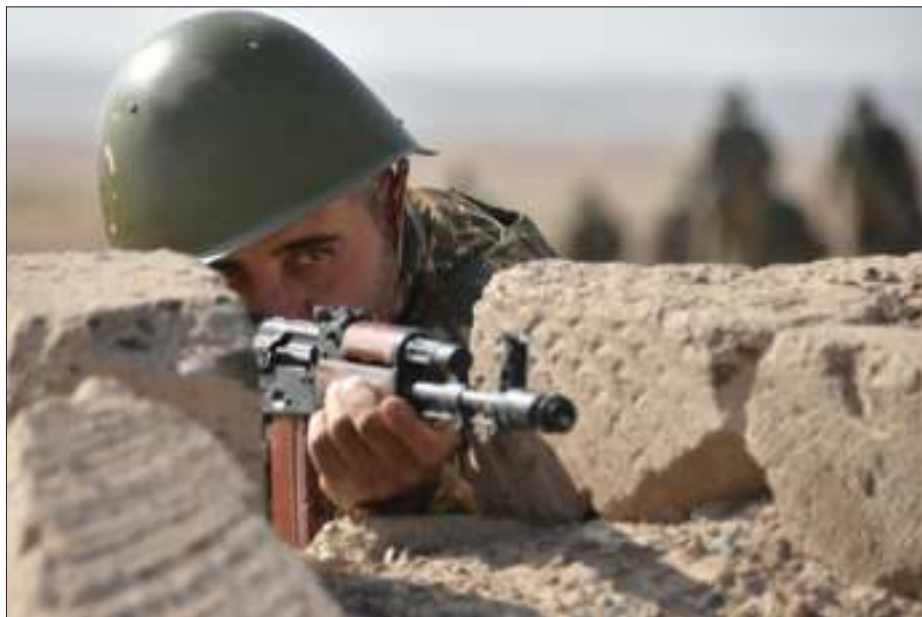
ARMENIA ON TUESDAY REPORTED DEATHS and the loss of military positions in border clashes with Azerbaijani troops, a year after the arch-foes fought a war over the disputed Nagorno-Karabakh region. (AFP)

Some foreign ministers visited Kabul over the past several weeks and representatives of the extended Troika plus meeting on Afghanistan - China, Pakistan, the United States and Russia - met Taliban Foreign Minister Amir Khan Muttaqi on the sidelines of their meeting in Islamabad last week.