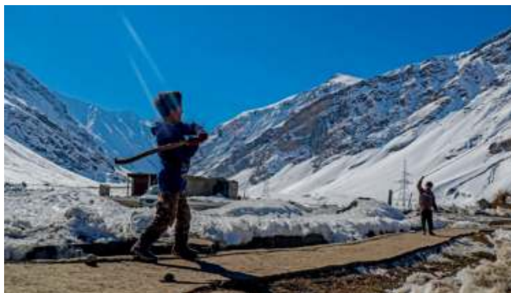
Children playing cricket on a sunny day in snow covered Drass Valley of Kargil on Friday.