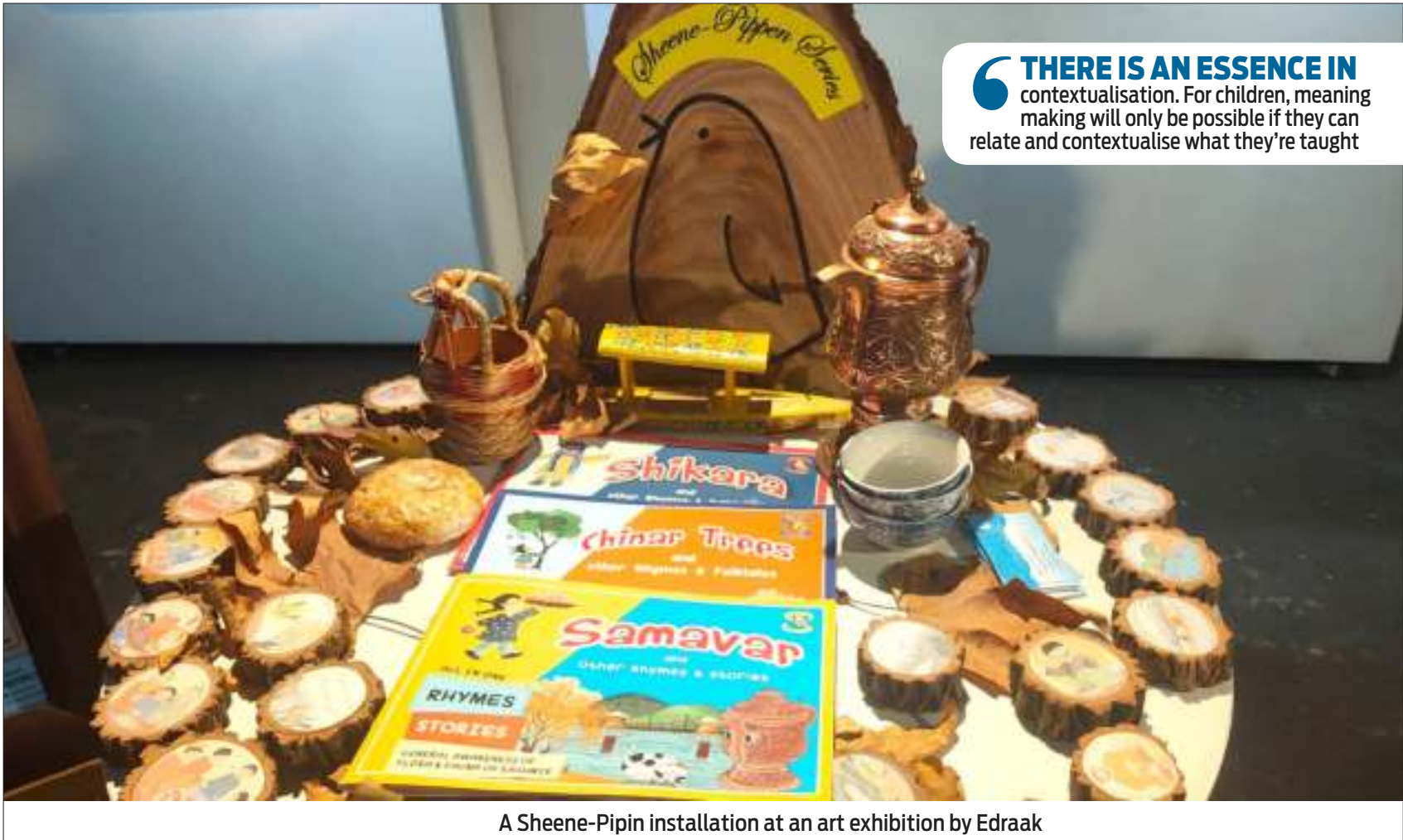
A Sheene-Pipin installation at an art exhibition by Edraak