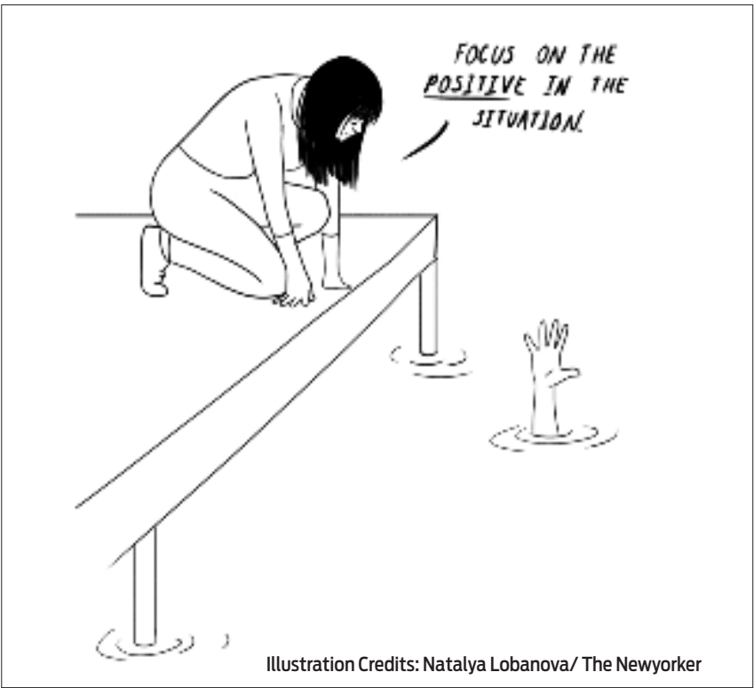
Illustration Credits: Natalya Lobanova/ The Newyorker