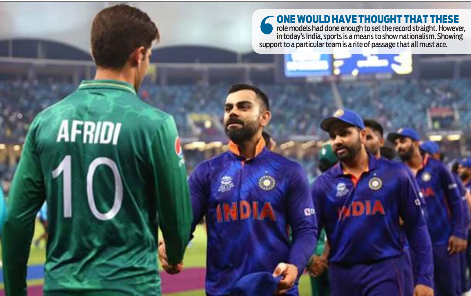
Virat Kohli greeting Shaheen Afridi

ONE WOULD HAVE THOUGHT THAT THESE role models had done enough to set the record straight. However, in today's India, sports is a means to show nationalism. Showing support to a particular team is a rite of passage that all must ace.