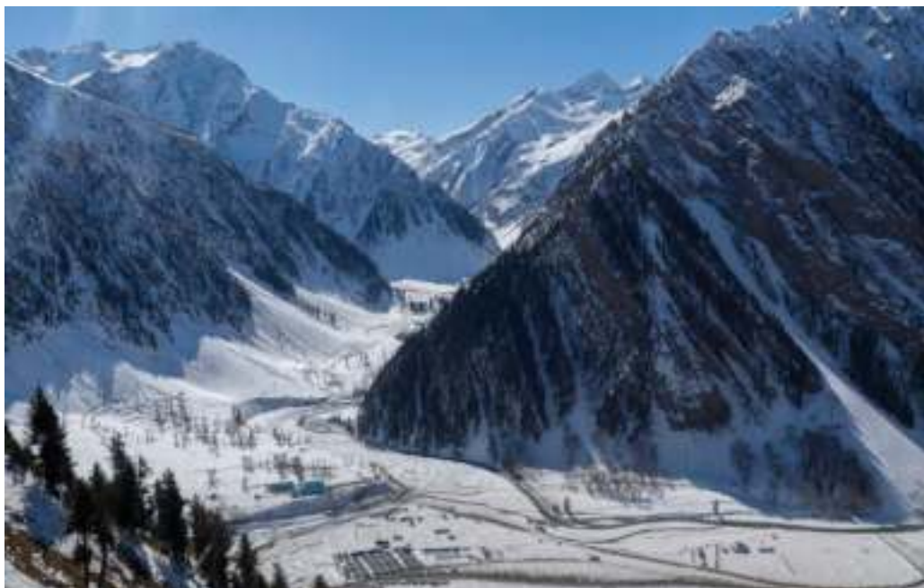
KO lens man Abid Bhat captures a breathtaking view of snow decked peaks at Battal on Srinagar- Ladakh highway.

Qazigund recorded a minimum temperature of 0.6 degree Celsius against previous night's 0.2 degree Celsius, the official said. It was minus 1.3 degree Celsius below normal for the place, the official said. Pahalgam, the famous resort in south More On P6