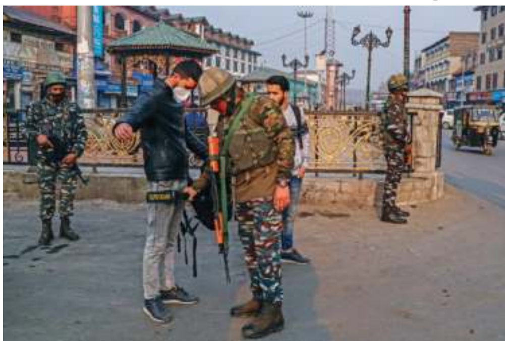
CRPF man using metal detector while frisking a youth in Lal Chowk area of this capital city.