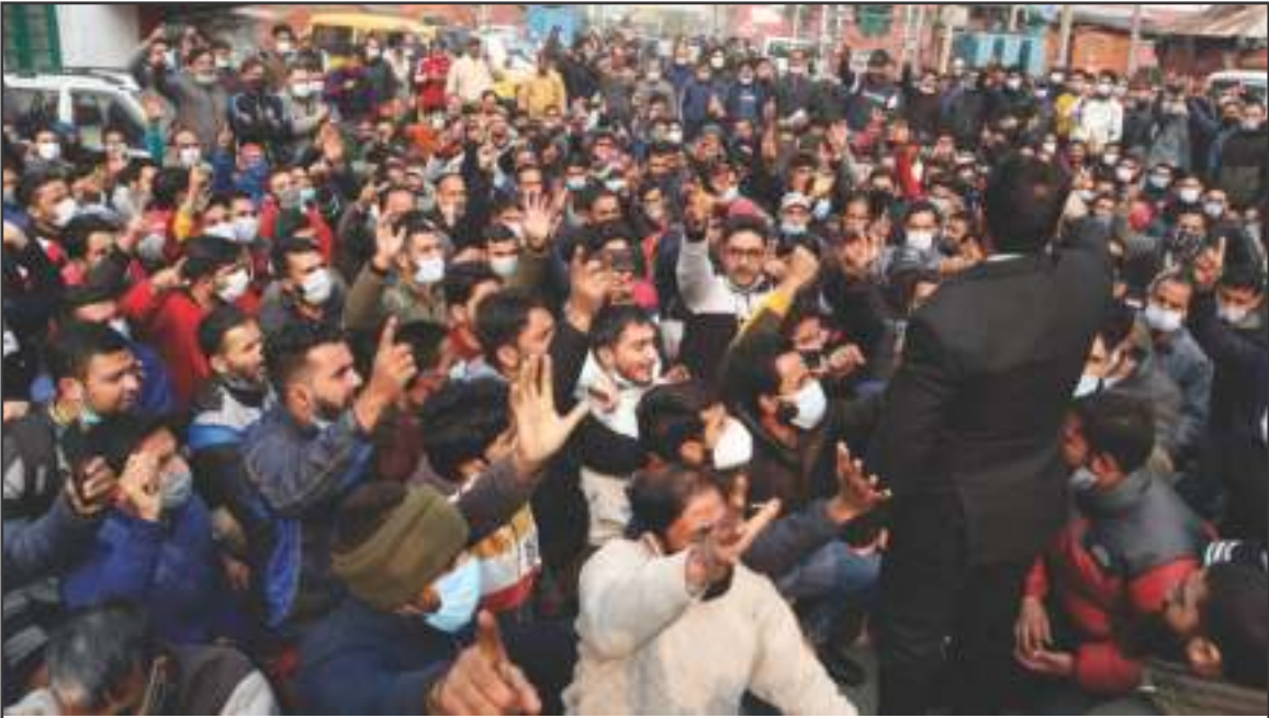
Hundreds of J&K Bank ATM guards on Wednesday staged protest in Srinagar, alleging that the new company that has overtaken the security of the Bank is firing most of them while at the same time they are made to face the salary cuts.

While pronouncing the objective of Moot Courts the Justice elaborated that it is a fine platform to make best out of our talent pool. He said that it imparts the knowledge and conduct in courts of law and above all the strength of drafting, pleading, convincing and research skills among the them.