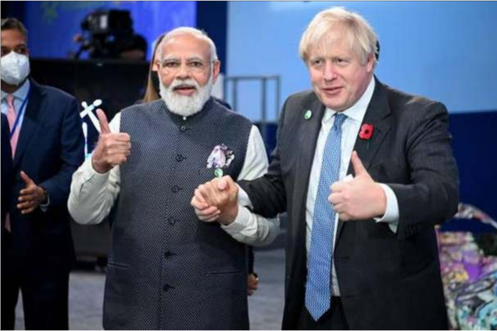
BRITAIN'S PRIME MINISTER Boris Johnson with Indian counterpart Narendra MOdi attend the World Leaders' Summit "Accelerating Clean Technology Innovation and Deployment", during the CoP26 in Glasgow on November 2, 2021.