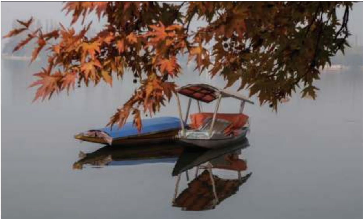
Two Shikaras stand anchored in Dal Lake as Aatish-e-Chinar hued autumn is gradually fading into winter in Kashmir.

The protesters appealed to JK Bank to take up the issue with the ‘Delta Company’.