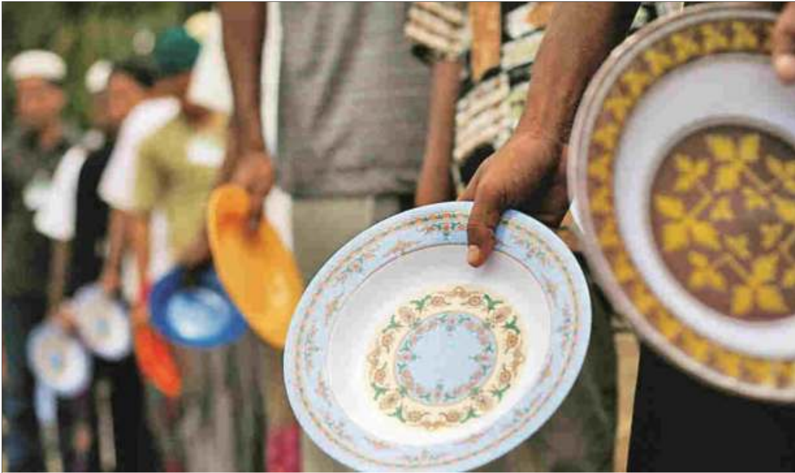
Representational image.

A Model That Ignores The Messy Truth Of Citizens’ Lives