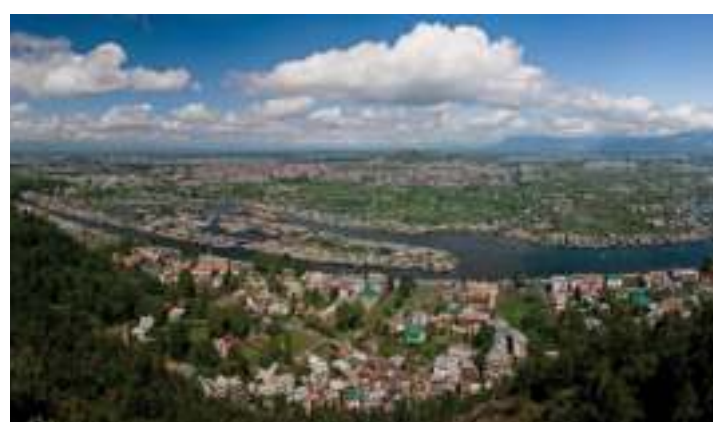
An aerial view of Srinagar. File photo

According to a release posted on the UNESCO site on Monday, the network now numbers 295 cities reaching 90 countries that invest in culture and creativity crafts and folk art, design, film, gastronomy, literature, media arts, and music to advance sustainable urban development. A new urban model needs to be