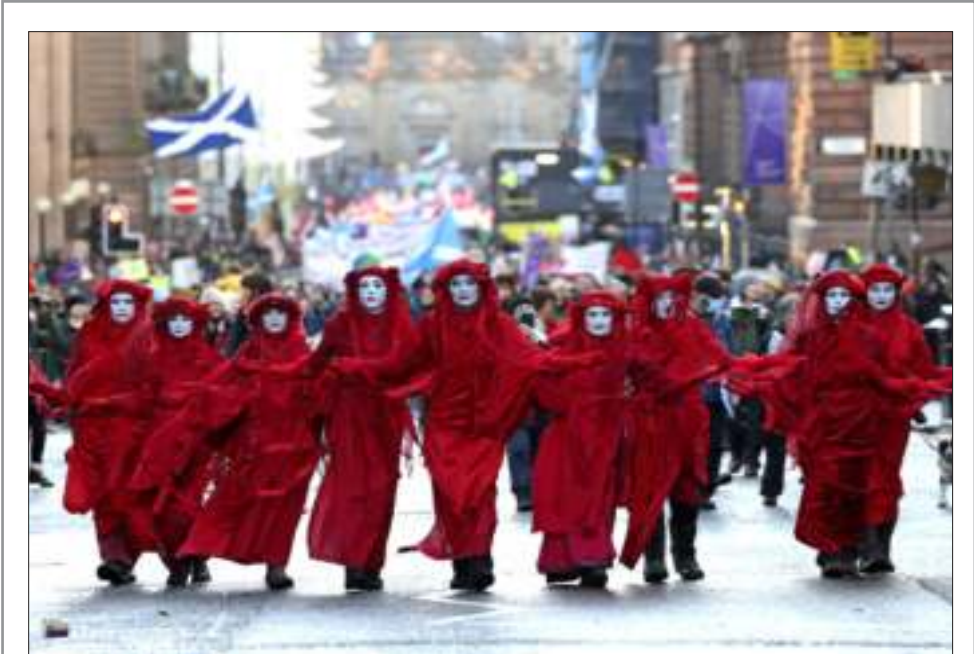
DEMONSTRATORS MARCH through the streets of Glasgow to demand global leaders move faster against the common challenge of global warming.