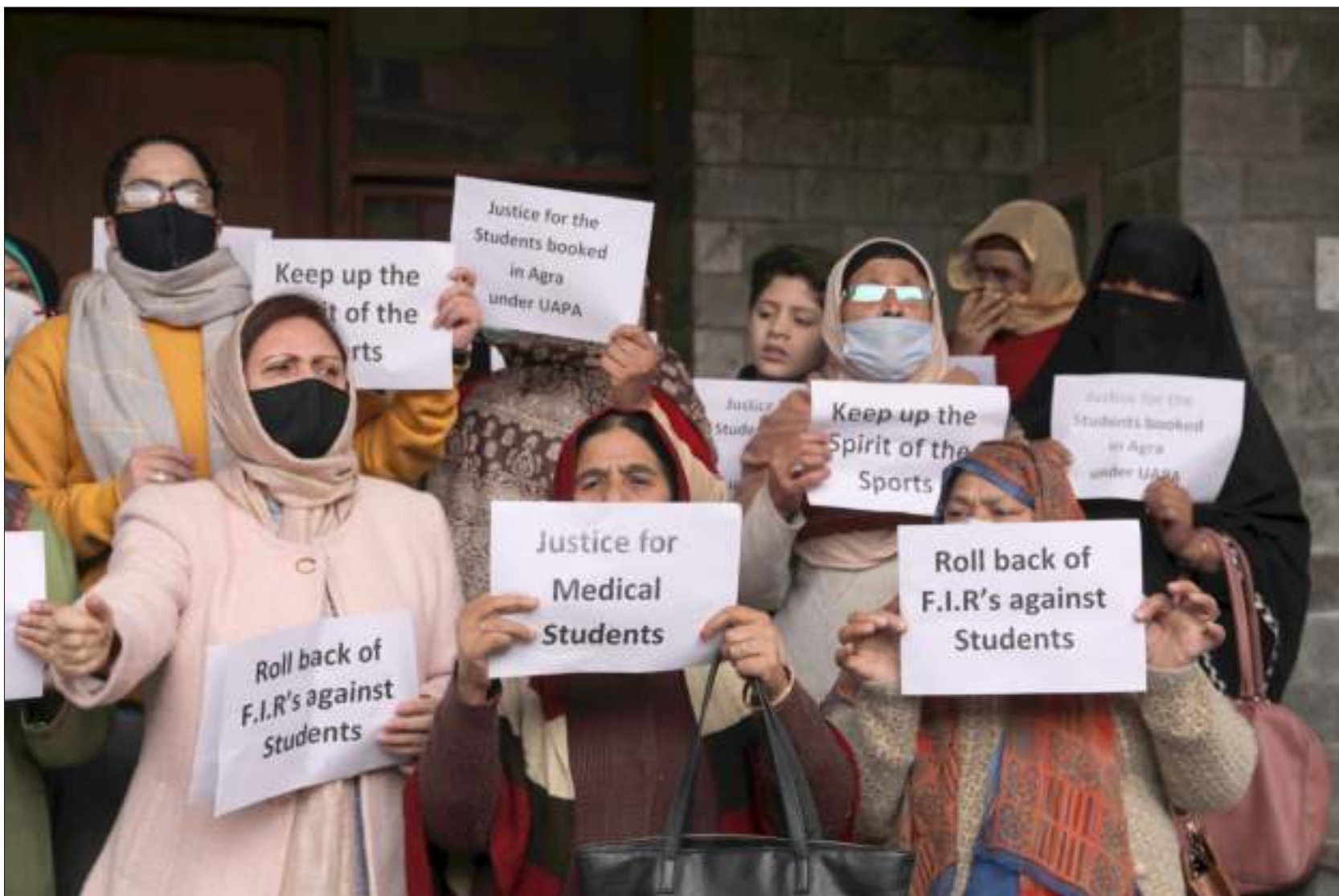
WOMEN'S WING of the Jammu and Kashmir National Conference on Monday staged a protest demonstration against the detention of Kashmiri students in Agra following the Indo-Pak Cricket match in the ongoing T20 Cricket World Cup.