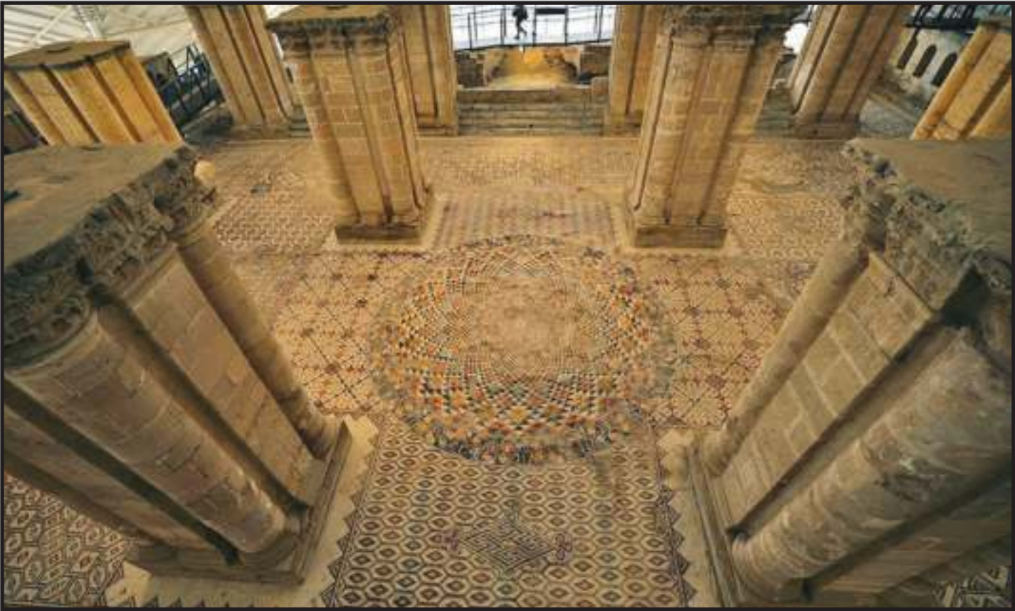
A view of one of the largest mosaic panels in the world. It was unveiled following a multi-year restoration project at Hisham's Palace, in the West Bank city of Jericho.