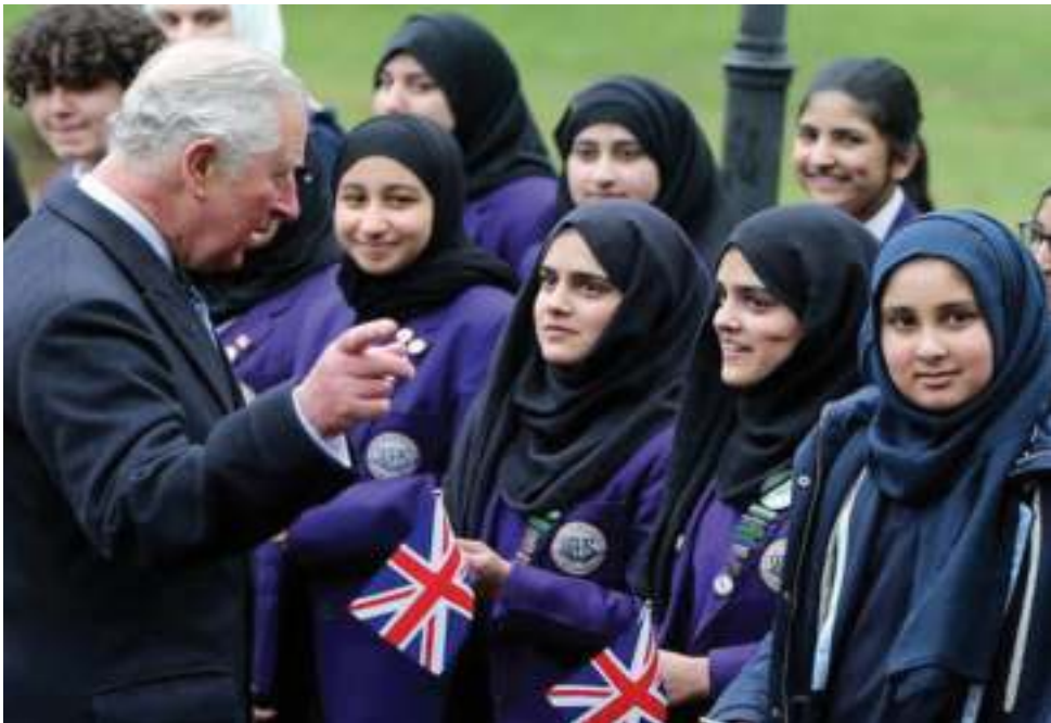
The Prince of Wales is greeted by local school children at the British Muslim Heritage Centre in Manchester, April 2019.

"We believe these are disappointing and disproportionate, and not what we'd expect from a close ally and partner," UK Environment Secretary George Eustice told lawmakers. "The measures being threatened do not appear to be compatible with the trade and cooperation agreement or wider international law," he said. — AP