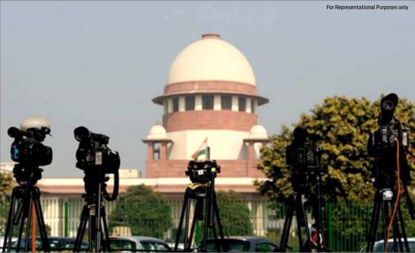
For Representational Purposes only