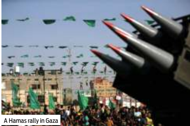
A Hamas rally in Gaza

The Islamist movement Hamas that rules the Gaza Strip announced Thursday it had sentenced six alestinian “informants” to death for collaborating with Israel.