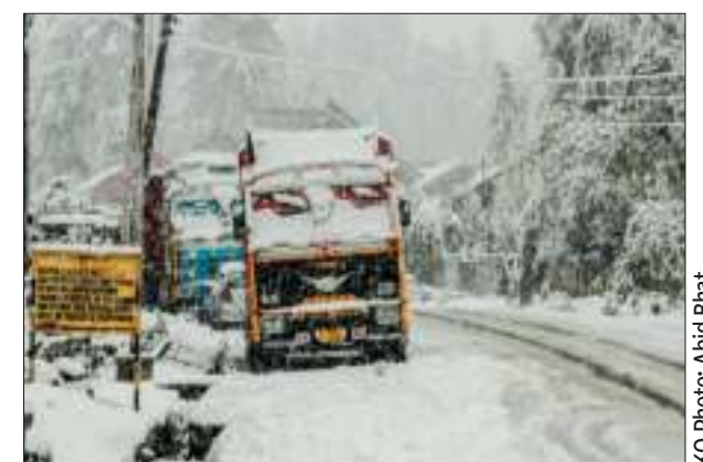
KO Photo: Abid Bhat

3 Killed By Mudslide In Pulwama, Banihal Highway Closed; Power Supply Affected