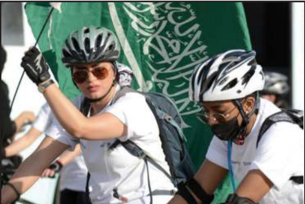
Saudi women take part in a cycling race to mark World Obesity Day celebration in Riyadh's Princess Nourah University.

The TLP has waged an anti-France campaign since President Emmanuel Macron defended the right of a satirical magazine to republish cartoons depicting the Prophet Mohammed - an act deemed blasphemous by many Muslims.