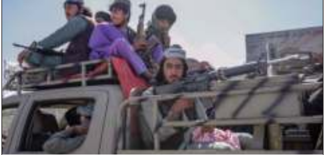
Taliban members drive along a road in the center of Kabul on October 14, 2021.

As a consequence, Israeli security forces are authorised to close the groups' offices, seize their assets and arrest and jail their staff members. Funding or even publicly expressing support for their activities is also prohibited.