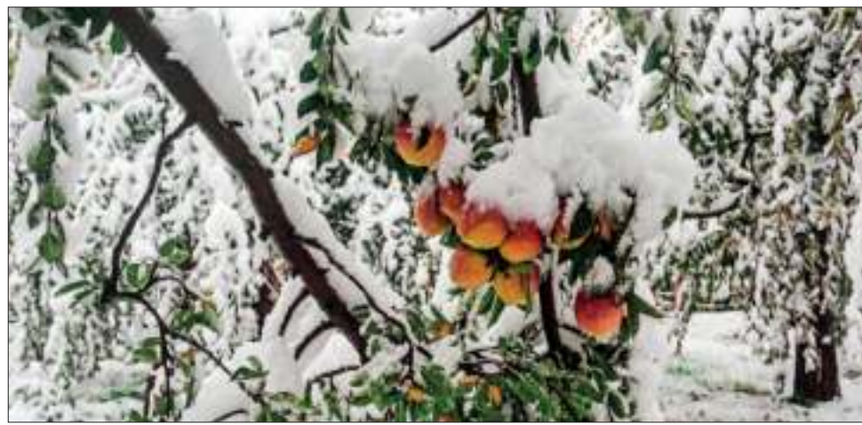
KO Photo: Abid Bhat

But despite the advisory asking growers to speed up harvesting, Arshad said it was an uphill task in the face of the recent non-local workforce departure from Kashmir.