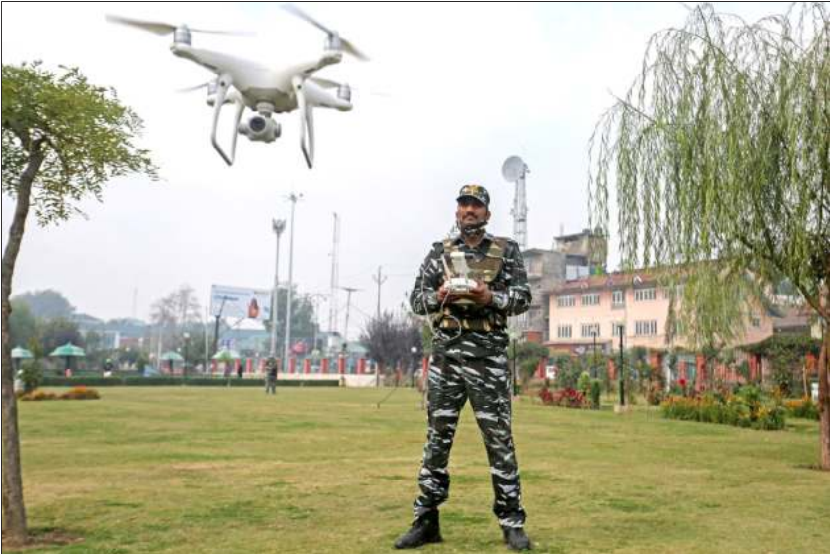
THE SECURITY FORCES PUT IN PLACE an “aerial surveillance cover” in the city Centre Lal Chowk to prevent further attacks by militants on the eve of Union Home Minister Amit Shah’s visit to Valley