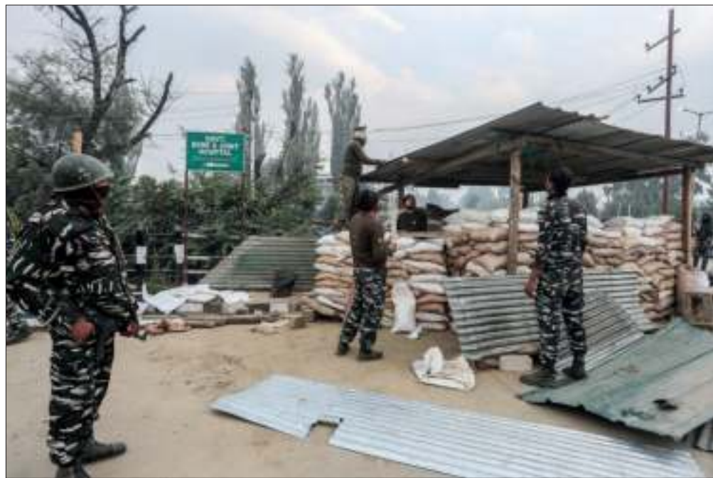
Many bunkers have come up in Srinagar ahead of Home Minister Amit Shah's visit to Valley