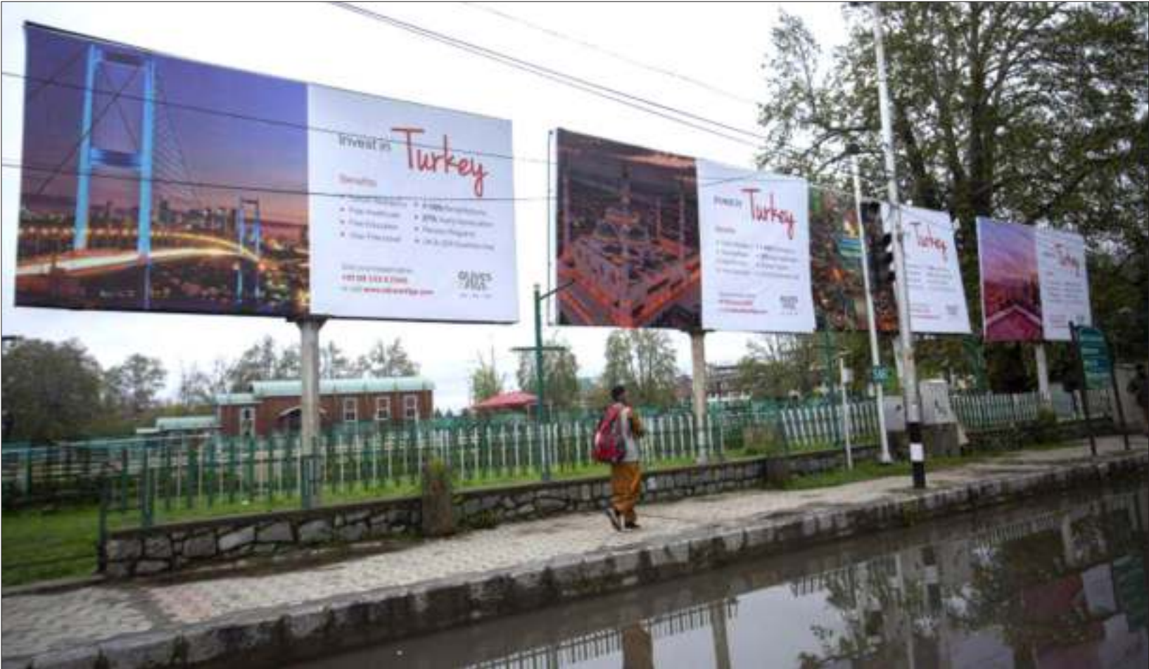
Hoardings calling for investment in Turkey came up in Srinagar.