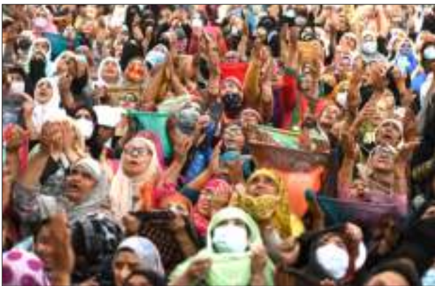
KO Photo Abid Bhat