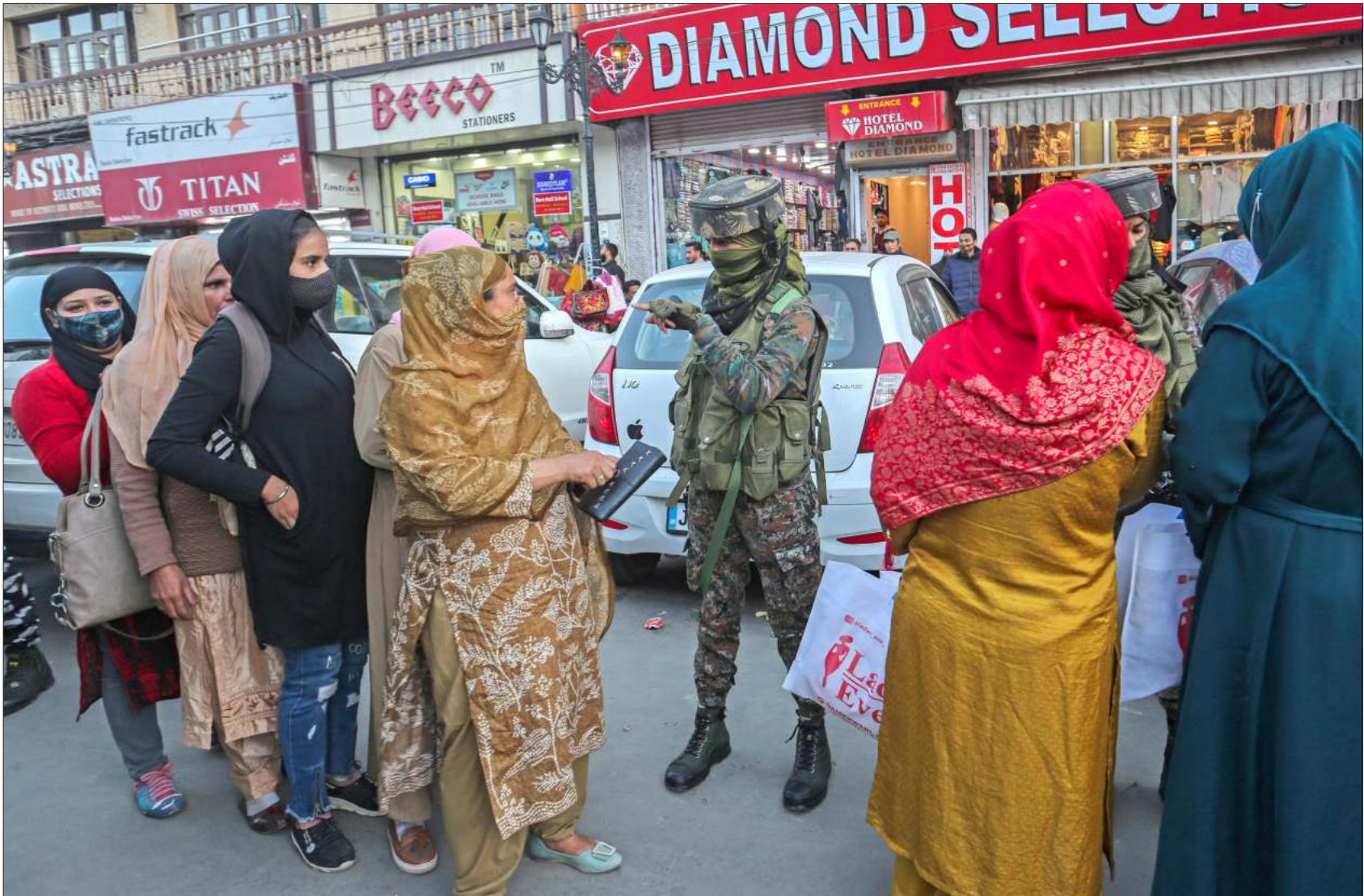
FOR THE SECOND DAY in a row women commuters were asked to disembark from minibuses and undergo frisking in the city centre on Tuesday.