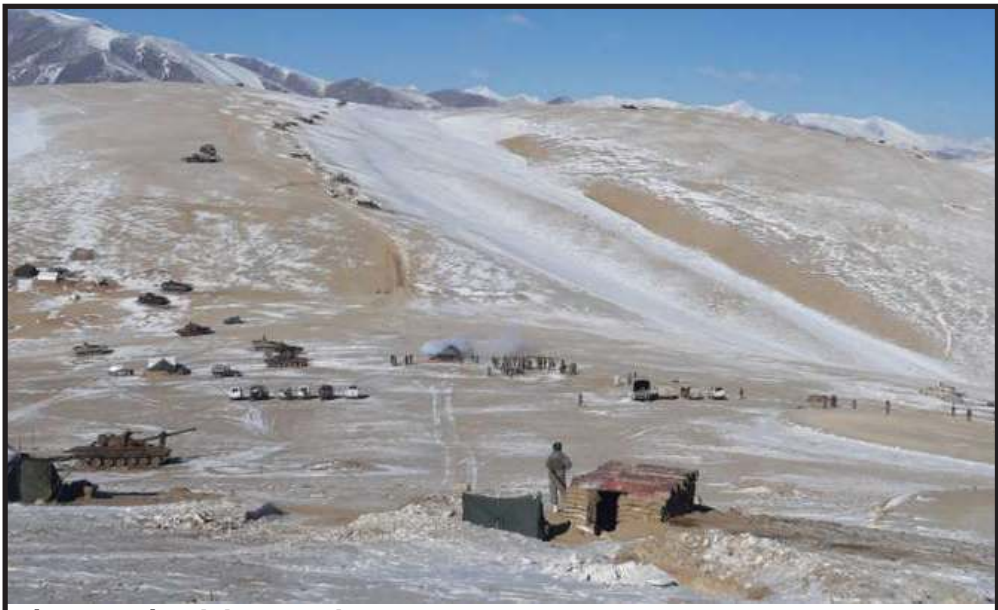
The annual training exercise that the PLA carries out there has seen some increase in the level of activities in the depth areas. Some of the reserve formations which the PLA mobilised continue to remain in their training areas that are in the operational depth areas

"This is a crucial step to minimise vaccine hesitancy driven by misinformation."