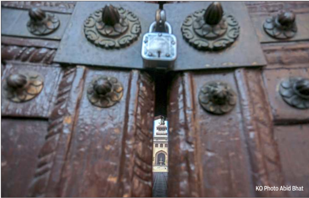
KO Photo Abid Bhat

In a statement, the Auqaf said, when employees opened up the gates of the mosque police personnel forced them to close all the gates and no namazis were allowed inside the mosque for offering the Friday prayers.