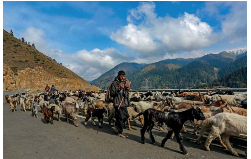
A nomad family migrating to Rajouri district from Kashmir, pass through Mughal Road with their herd on Thursday.

"Under the influence of approaching western Disturbance and lower level easterlies, fresh spell of intermittent light to moderate rain with ● More On P10