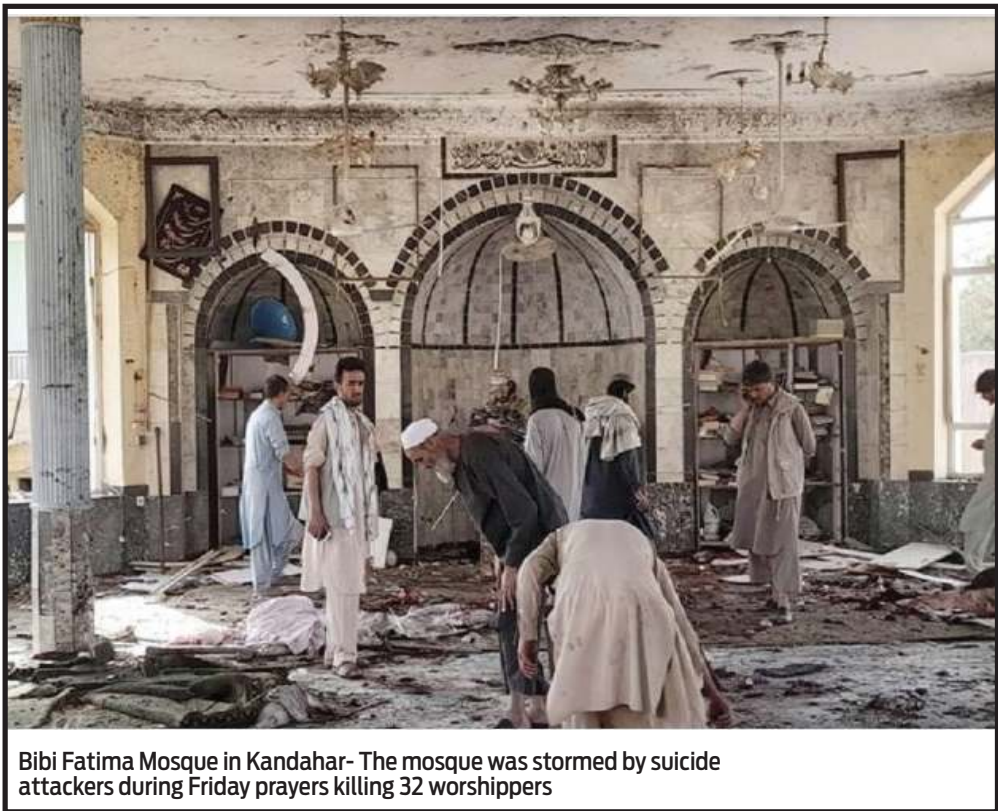
Bibi Fatima Mosque in Kandahar- The mosque was stormed by suicide attackers during Friday prayers killing 32 worshippers