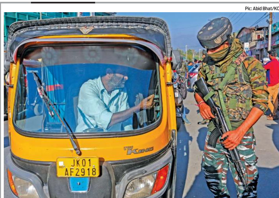
AN AUTO DRIVER ASKING to be heard during security checking in Lal Chowk, Srinagar on Friday, October 15.

They expressed their concern over the matter and urged the administration in J&K to devise a proper mechanism for reopening of the primary schools as well.