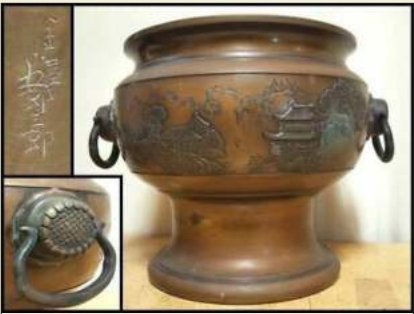
Japanese Portable Stove

The Japanese pocket stove is much advanced. It employs a specially prepared fuel with origins in ancient experiments to produce a slow match for preserving fire for a long time. The pocket stove is made of copper or tin with a perforated lid and is designed to fit the wearer. The cartridges of special charcoal are filled in it and lighted up and the lid is closed and the user enjoys that warmth for half a day with the special Japanese charcoal.