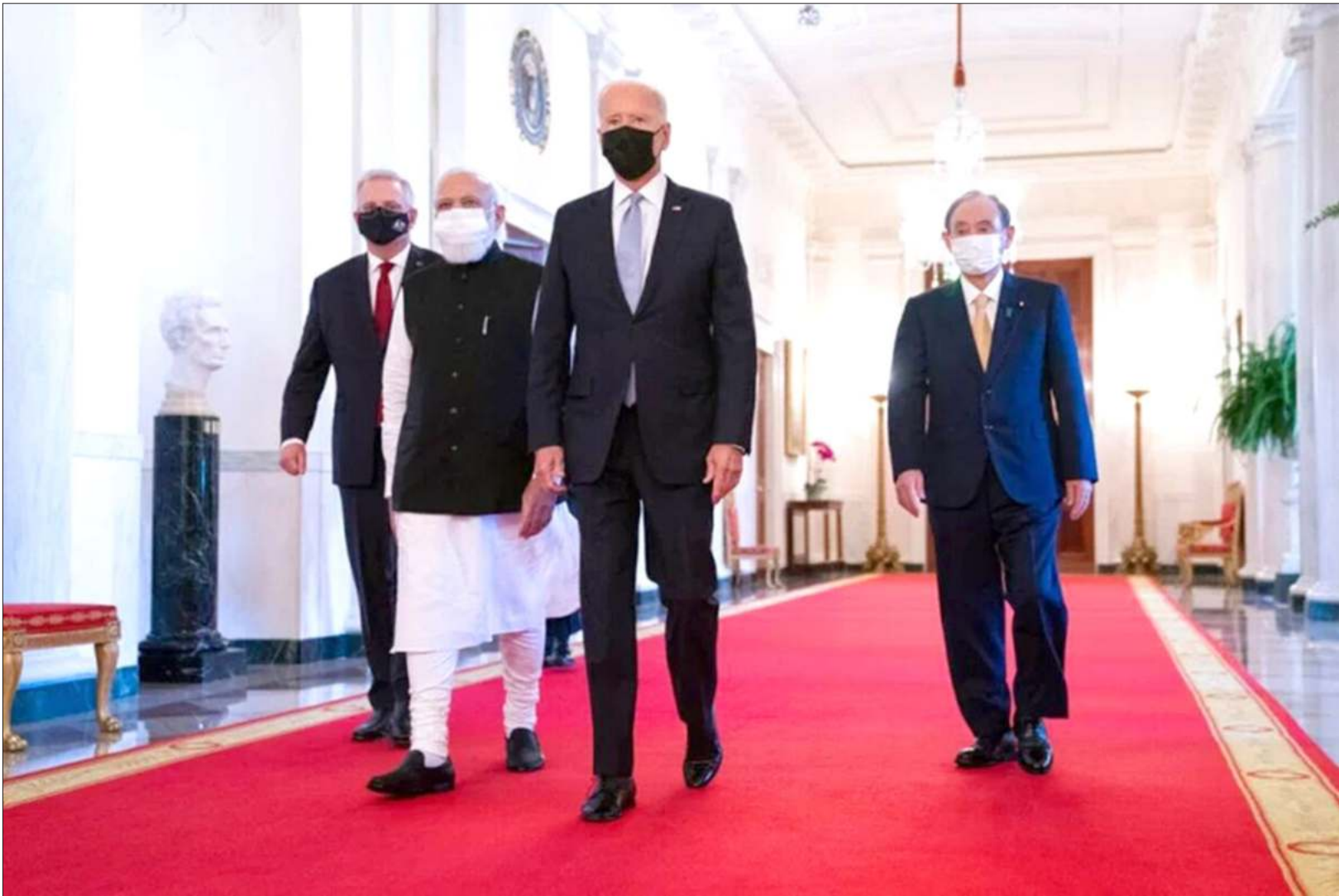
JAPAN AND AUSTRALIA are not irrelevant in this sphere, but they are minnows compared to the US.