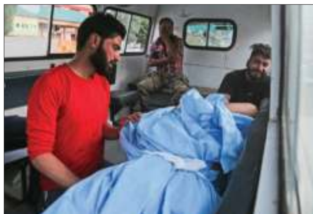
KO Photo: Abid Bhat

Meanwhile, police have blamed militants for carrying out the fatal attack on the youth. According to a police