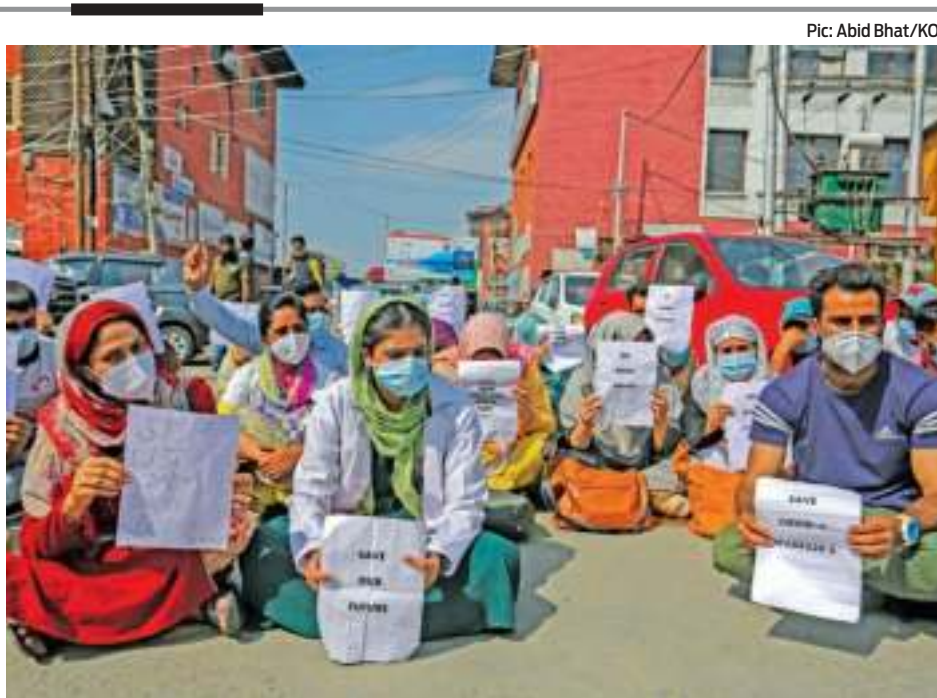
NURSES OF NHM STAGED SIT-IN protest in Srinagar demanding continuation of their services in the Health Department.

Notably, around half population of the valley is directly or indirectly on fruit industry as this industry has a turnover of around 20,000 crore annually.