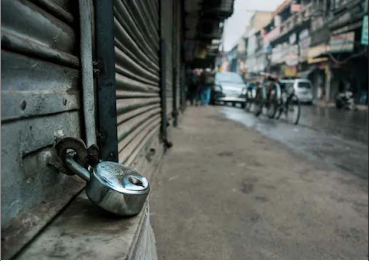
TRADERS AND VARIOUS POLITICAL PARTIES' activists are protesting protests in Jammu against the proposed opening of 100 Reliance retail stores in Jammu, a claim which the company said is 'completely untrue

The September 22 Bandh Was Only About Protecting Jammu From Some Side-Effects Of The Loss Of Autonomy, Not An Opposition To What Happened On August 5, 2019