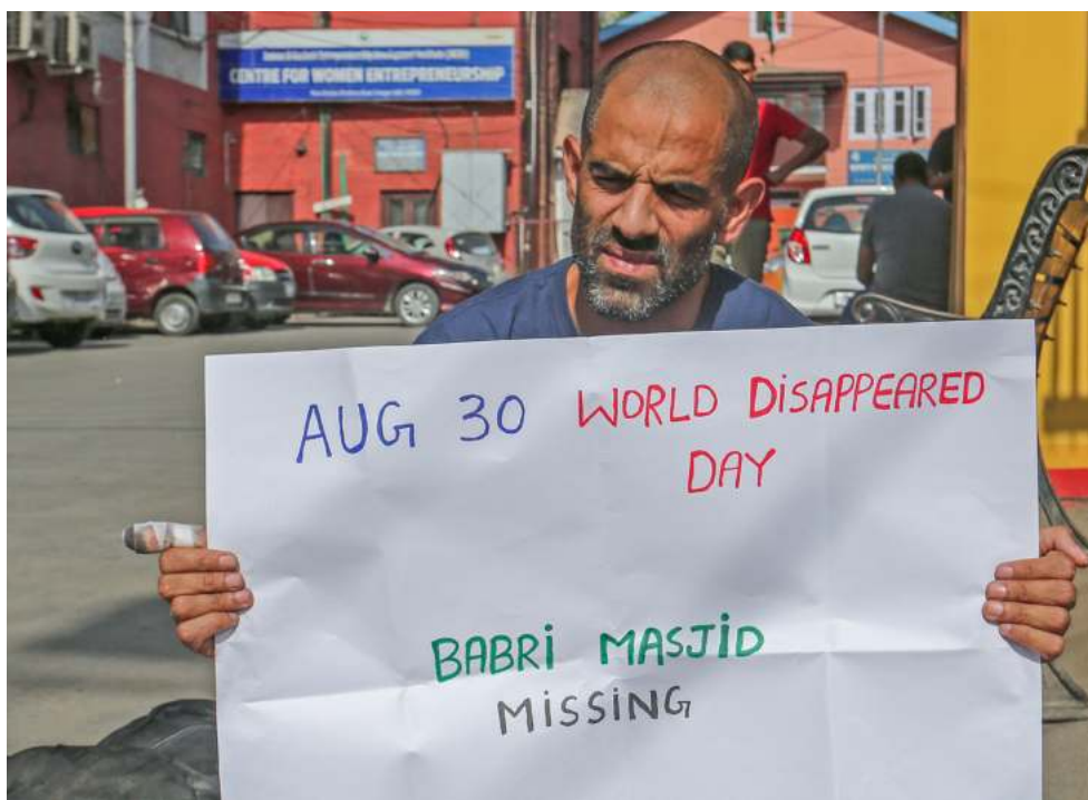
A protester on Monday sat on a protest demonstration in Srinagar's Press Colony on the eve of International Day of the Disappeared.

Over the years, MFCWL has built an organized ecosystem in the highly unorganized pre-owned cars sector, creating a circle of trust and transparency among franchisees, customers, dealers and institutional clients. All franchise owners have access to technology, training, software, branding and marketing. MFCWL has the largest collection of 5000+ certified vehicles sold through an omnichannel model to customers across the length and breadth of the country.