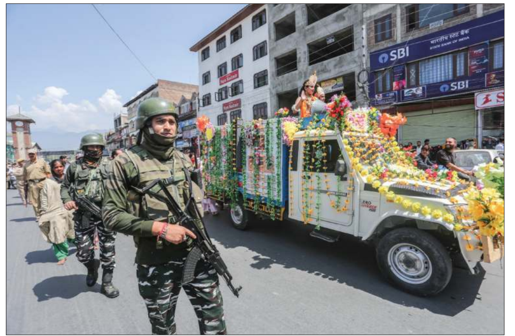
Janmashtami was celebrated in Srinagar with a procession passing through many areas of uptown and culminating at Lal Chowk.

"We are also in wait and watch mode because the trust deficit between both the nations is a major problem, he said, adding that no ceasefire violation by ● More On P6