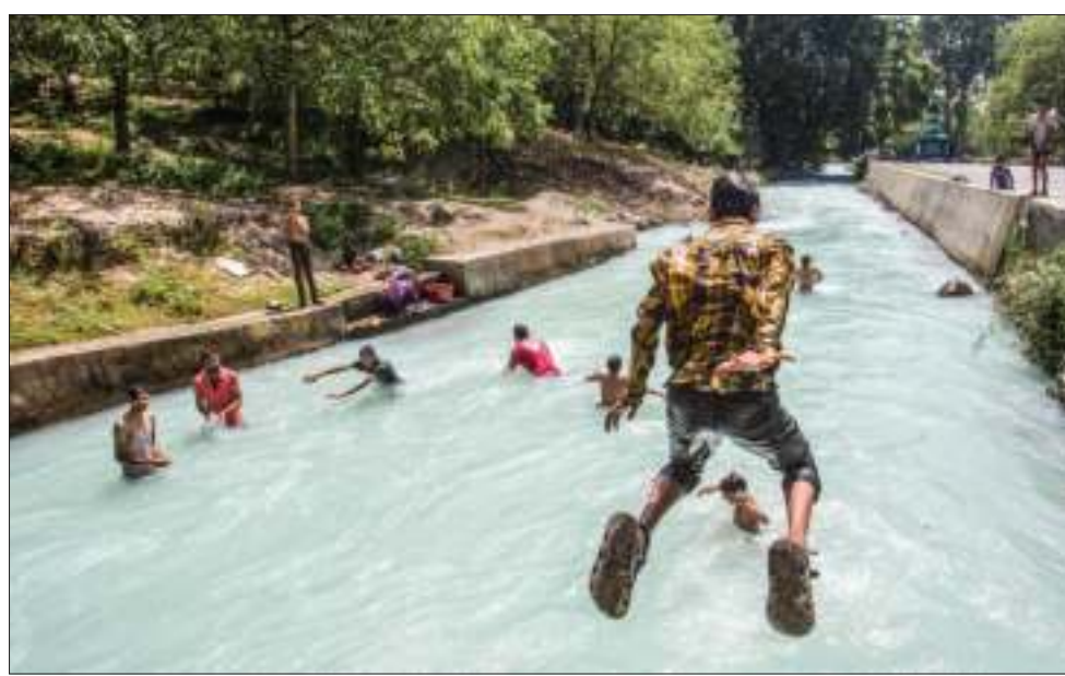
A boy jumps in a stream in Ashmuqam hamlet of Anantnag district during a sunny hot day on Saturday.