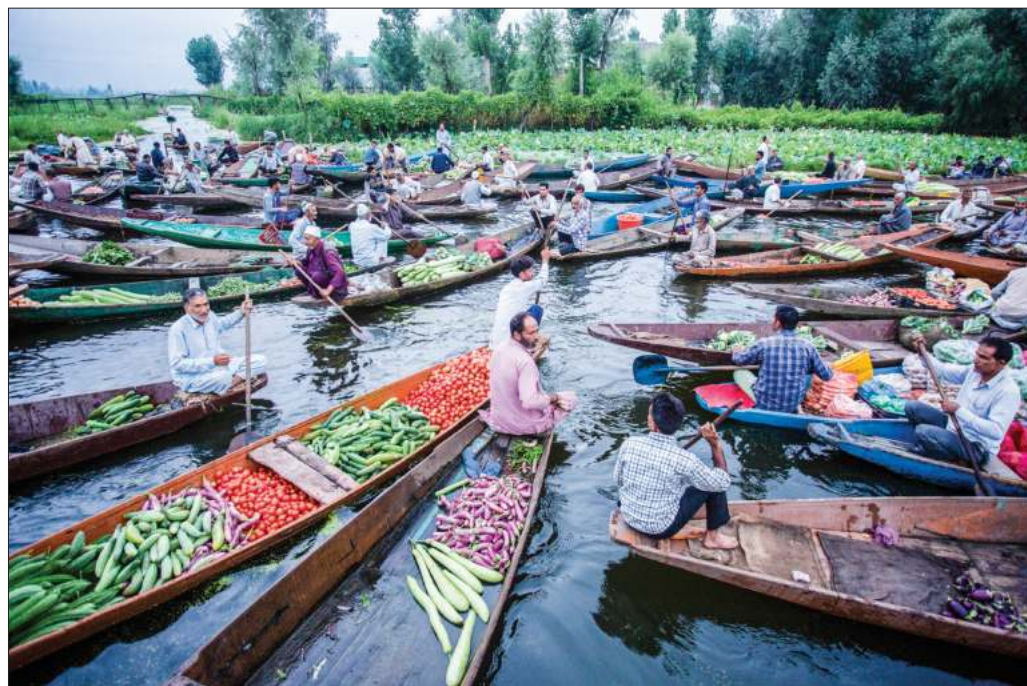
Vendors assemble with their vegetable laden boats at the floating vegetable market in the interiors of Dal Lake on Thursday.

According to officials, 119 more coronavirus infected patients have recovered from Jammu and Kashmir during the last 24 hours, leaving the number of active cases at 1060-338 in Jammu and 722 in Kashmir. During the same time, they said, Kashmir reported 84 new cases of Covid-19 while 17 cases were • More On P10