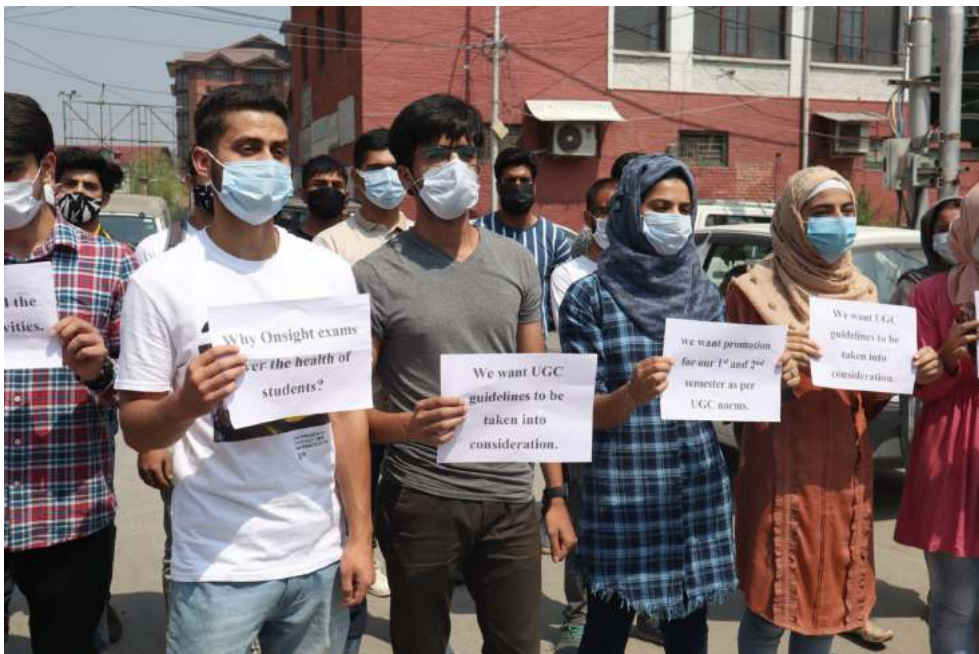
The undergraduate students on Thursday staged in protest demonstration in Press Enclave Srinagar demanding implementation of UGC guidelines.