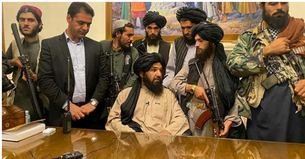
Taliban fighters take control of Afghan presidential palace in Kabul_ person second from left is a former bodyguard for former president Ashraf Ghani

The Taliban scotched any hopes of a negotiated peace deal with the Afghan government by overrunning the country in under two weeks -- a lightning offensive that ended with them taking Ka-