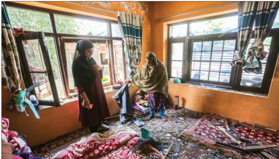
AFTERMATH: A family salvages belongings from the damaged house after the encounter.