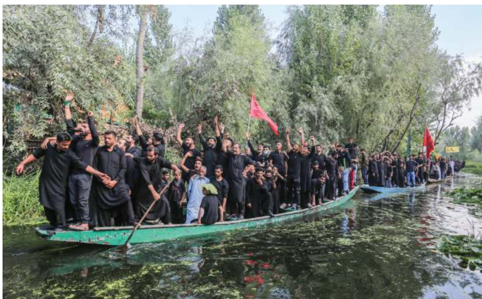
On the ninth day of Muharram, mourners took out a procession in boats in the interiors of Dal Lake on Wednesday.

LEH: Ladakh has recorded 11 fresh Covid cases, taking its overall tally to 20,466, with active cases increasing to 81, officials said on Wednesday. The Union Territory has registered 207 Covid-related deaths – 149 in Leh district and 58 in Kargil district – since the outbreak of the pandemic last year. A total of 20,164 patients have recovered till date. Of the 11 cases reported • More On P10