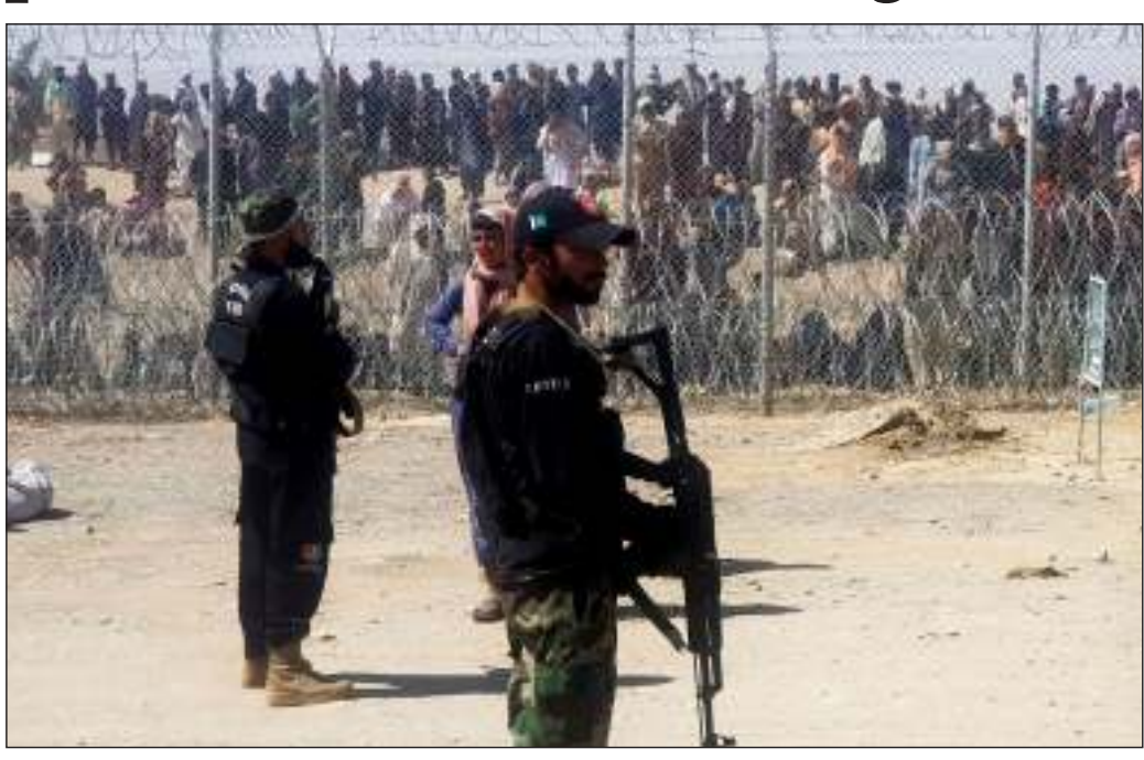
PAKISTANI SOLDIERS STAND GUARD IN FRONT of people waiting to cross at the Friendship Gate crossing point in the Pakistan-Afghanistan border town of Chaman, Pakistan