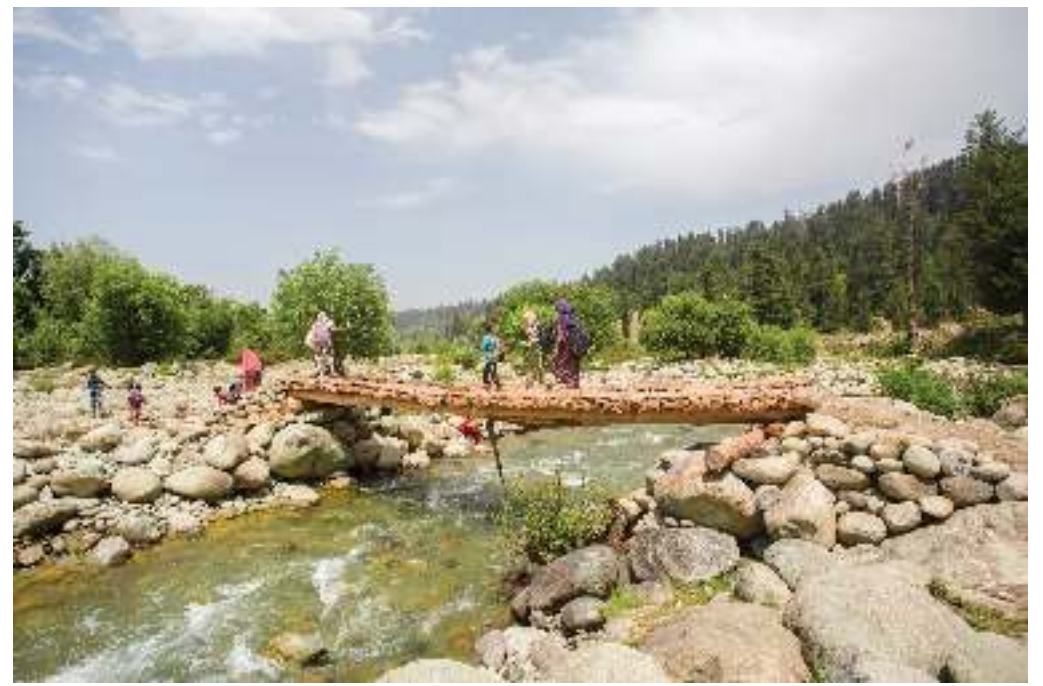
Students cross a wooden bridge to reach a community school in a remote village in Budgam district on Friday.

Any Kashmiri Pandit and displaced person, who may have left Kashmir in 1944 before Independence and has proof of owning • More On P10