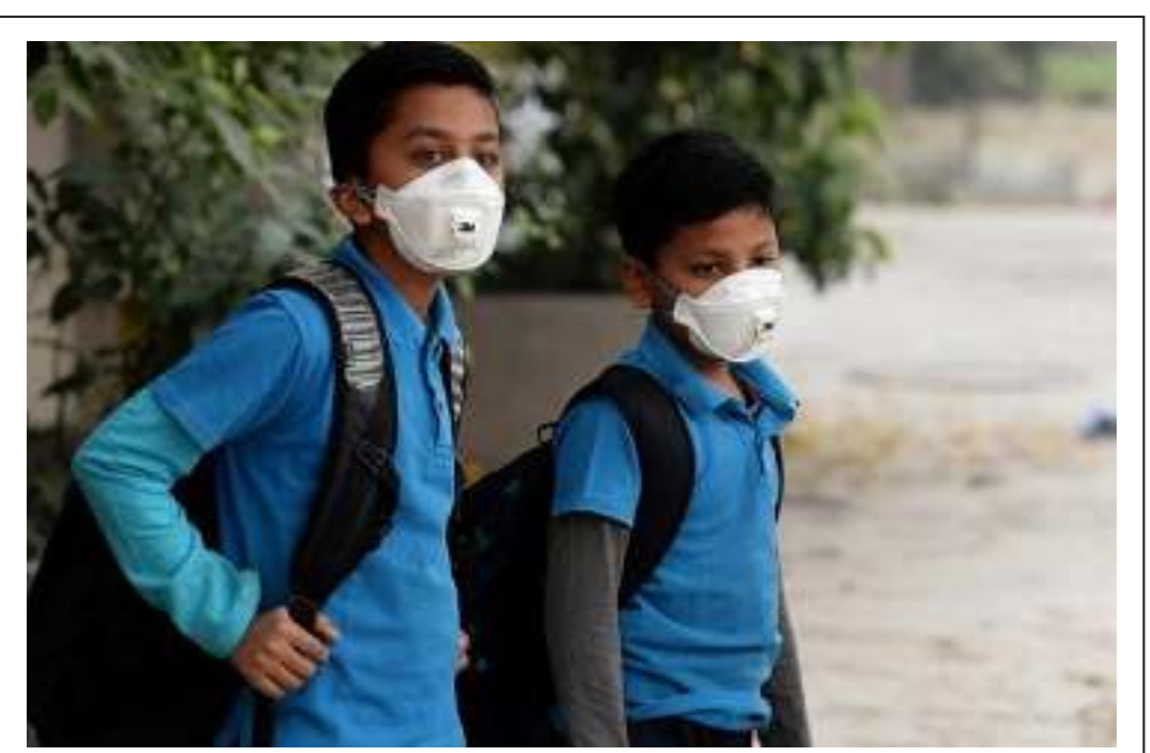
In future, COVID-19 may affect mostly children, a study claimed. (Representational Image)

"For many infectious respiratory sonal coronaviruses indicates that diseases, prevalence in the populashort-term immunity to reinfection, but then recedes in a diminishing wave pattern as the spread of