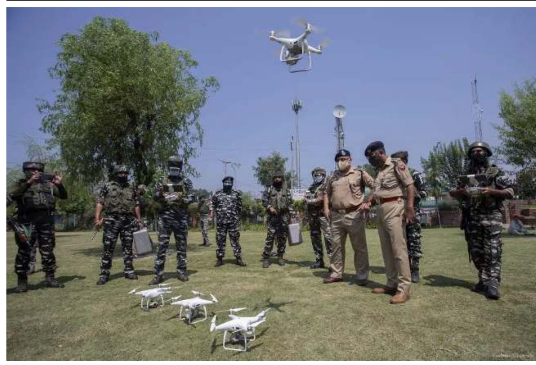
Security Forces on Thursday conducted a successful trial of drones in Srinagar to keep the city under aerial surveillance while massive frisking operations were started ahead of the Independence Day in the summer capital and elsewhere. ....