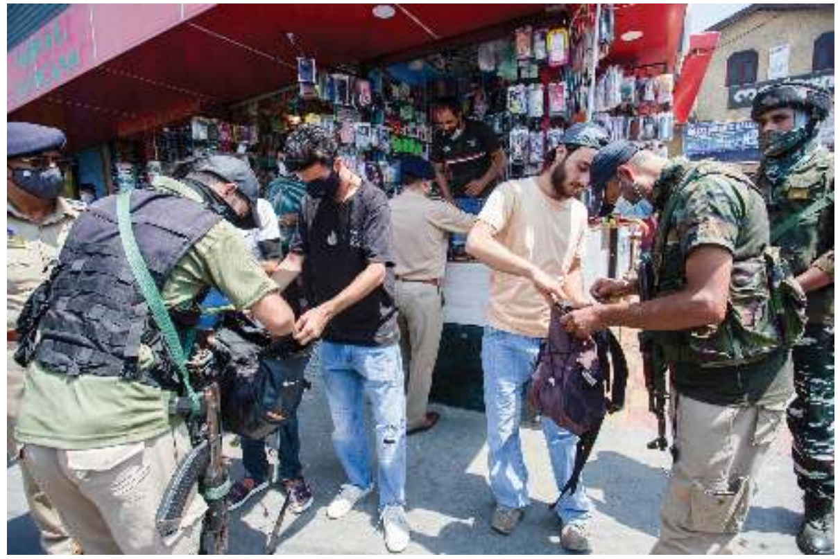
Security arrangements in Srinagar were tightened on Thursday ahead of August 15 celebrations.