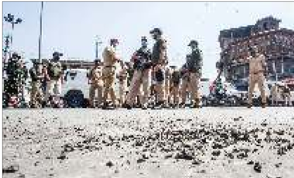
Security personnel inspecting the site of a grenade attack in Srinagar's Hari Singh High Street on Tuesday.