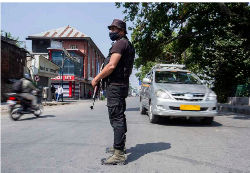
Tight security measures were put in place in Srinagar on Thursday to mark the second anniversary of the abrogation of J&K's special status.

He made these remarks while interacting with the Chairpersons of District Development Councils of Kashmir Division at Civil Secretariat here, an official spokesperson said. A similar interaction with. More On P2