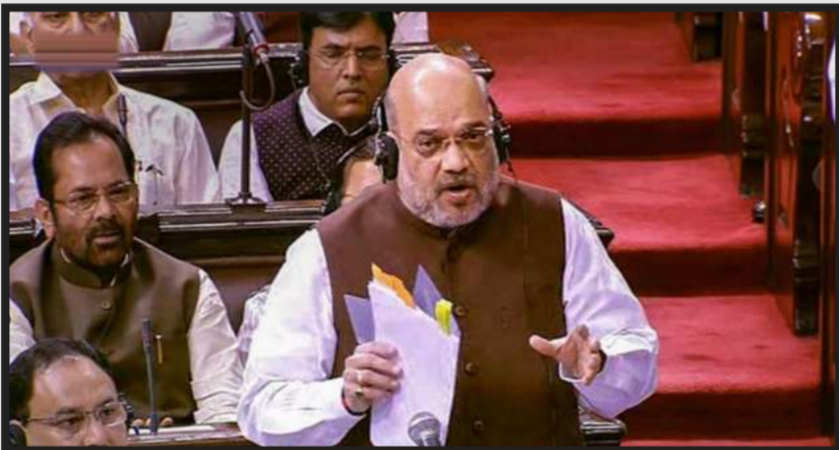
Home Minister Amit Shah announcing the Government's decision to Abrogate Article 370 on August 5th 2019 following which J&K was locked down and all communication was snapped