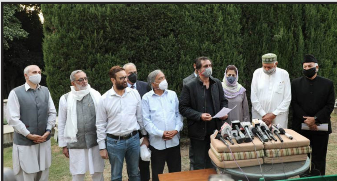
People's Alliance for Gupkar Declaration met after the abrogation of Article 370 and released a statement that they will contest the DDC polls jointly. Abdullah was on October 15 elected PAGD's president while PDP president and former chief minister Mehbooba Mufti was named as vice president and People's Conference chief Sajad Lone as spokesperson. The decision to contest the polls was announced by Lone at a press conference in Jammu after a meeting of PAGD leaders. However, Sajad Lone's People's Conference left the alliance soon after