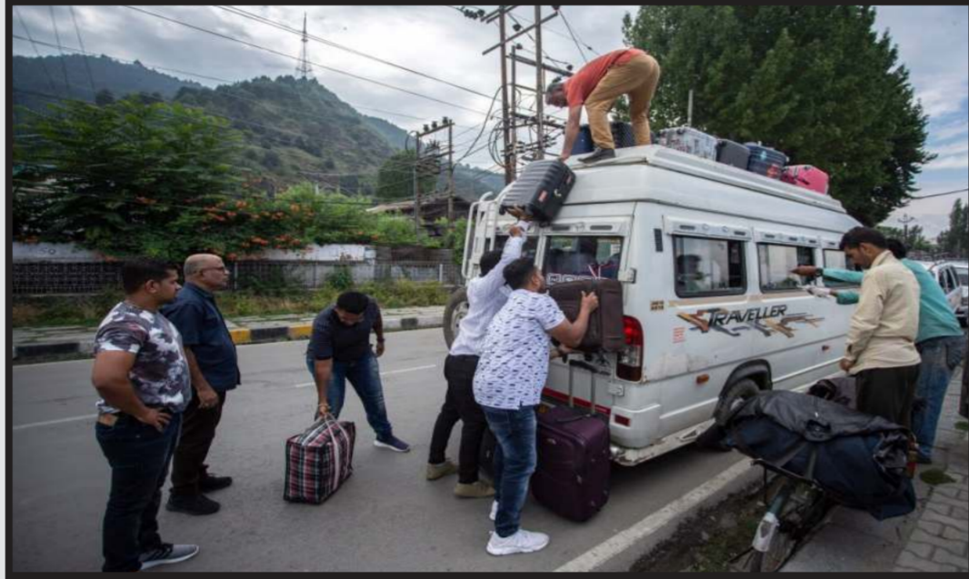
Tourists and Amarnath pilgrims were asked to leave Kashmir Valley on 3rd August, Saturday in the wake of J&K authorities issuing an advisory, asking them to cut short their stay citing security threats.