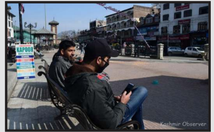
After 550 Days, Govt Lifted 4G Ban in J&K on 5th February 2020