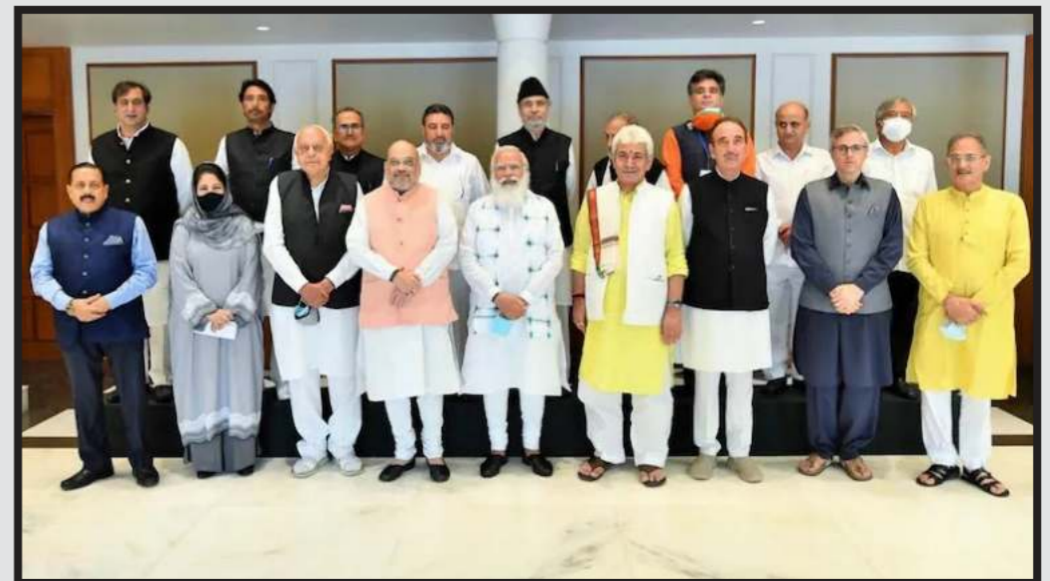
13 leaders from J&K along with LG Manoj Sinha met Modi & Amit Shah on PM's All Party Meet in Delhi. However, PAGD released a statement soon after claiming they were dissatisfied with the outcome of the meet. On the 2nd Anniversary of Abrogation of Article 370, in a statement on Wednesday, PAGD spokesperson Mohammad Yusuf Tarigami has also said, "The hoax of BJP's Naya Kashmir is a joke now. People have started questioning those in authority as [to] what they have achieved by destroying Kashmir"