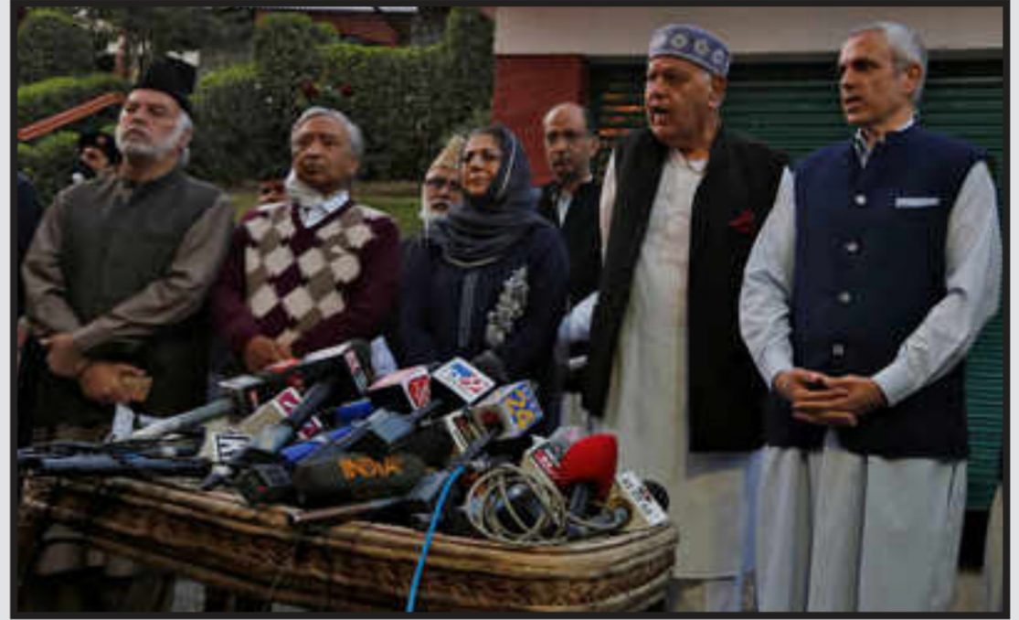
On August 4, 2019, a day before the central government announced the abrogation of Article 370, political parties in Kashmir, except the BJP, met at the residence of National Conference president Farooq Abdullah at Gupkar Road in Srinagar and adopted a declaration to defend Article 370