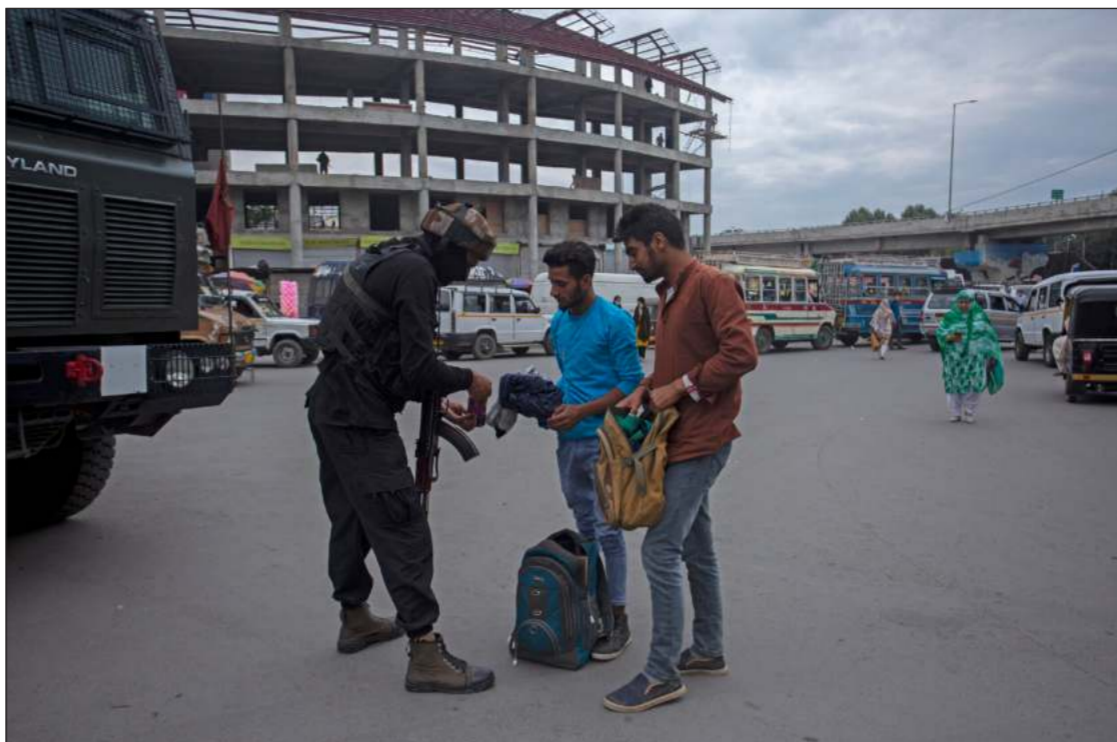
Government forces checking pedestrians in capital city Srinagar on Wednesday as security was beefed ahead of the anniversary of 'abrogation of special status'.

completed. The PHC has a 25 bed oxygen facility as well to have in house Covid Care infrastructure. The DDC was informed that all people residing in the area have been administered with Covid-19 vaccines.