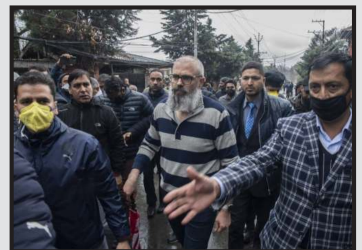
Former Chief Minister Omar Abdullah walked out of detention after nearly eight months on 24th March 2020