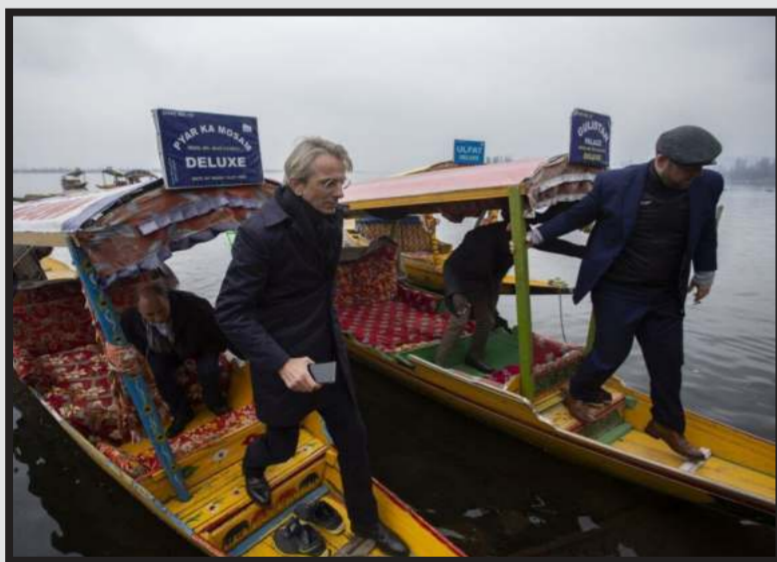
Diplomats' Day Out In Kashmir, Feb 12 2020. The second batch of diplomats on a conducted tour of strife torn Kashmir went for a Shikara ride on day one of their tour