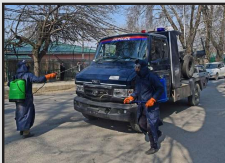
Covid-19 visits Kashmir, prolonging an already halted life. Municipal workers seen in action in Srinagar in their bid to contain the spread of dreaded COVID-19 pandemic