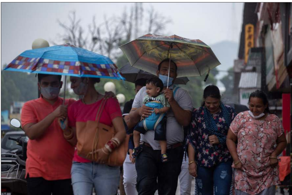
Non-local tourists walk along the famous Boulevard Road in Srinagar on Wednesday as rains lashed the capital city bringing down the temperature.

The court also quashed detention order (42/DMP/ PSA/ 20) passed by District Magistrate Pulwama on 24 November 2020 against Umar Yousaf Bhat of Pulwama.