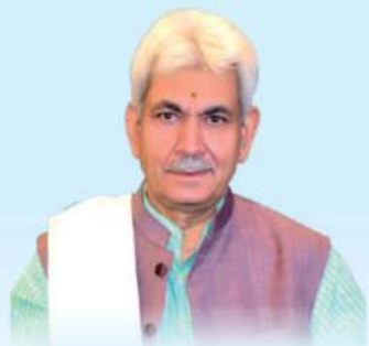
Shri Manoj Sinha Hon'ble Lieutenant Governor

Kashmiri Pandits have been feeling "more secure" and over 3,800 youngsters from the community have moved back to ● More On P10