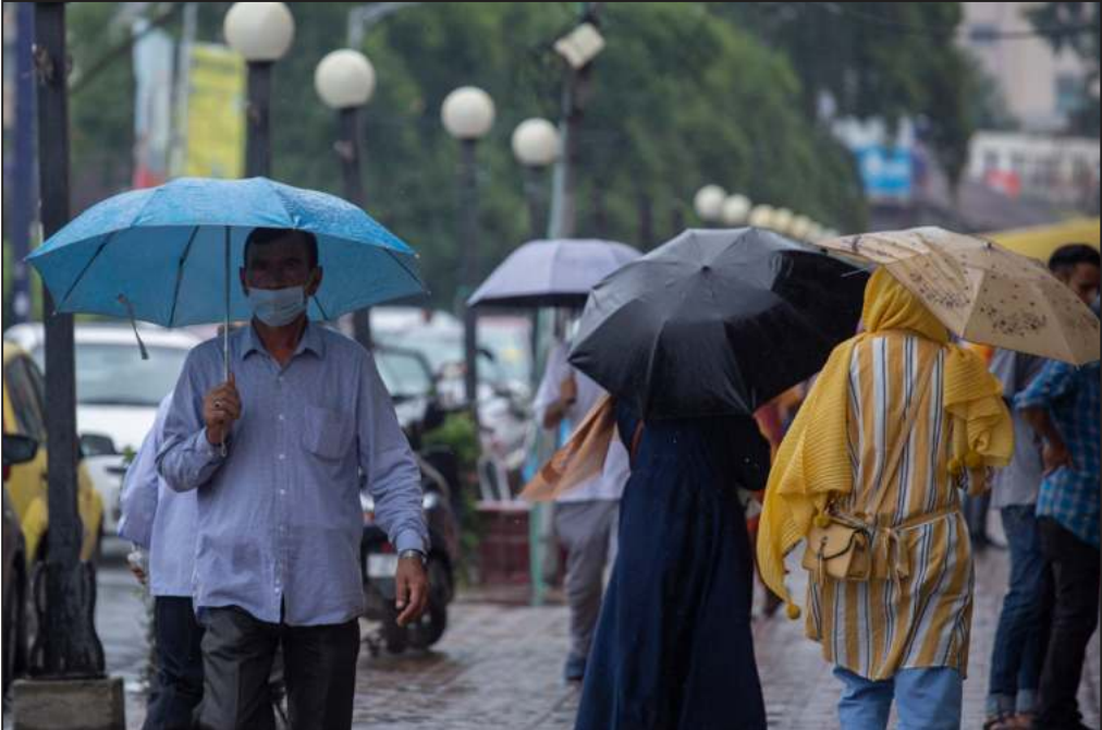
Caption: Rains lashed parts of Kashmir valley on Wednesday bringing the much needed respite from the scorching heat.

The number of active cases again rose slightly to 1,139 in the Union Territory, while 3,15,511 patients have recovered so far, the officials said. The death toll due to the pandemic was 4,376 as one new fatality was reported in the past 24 hours. Meanwhile, the officials said there were 35 confirmed cases of Mucormycosis (black fungus) in the Union Territory as no fresh case was reported since last evening.