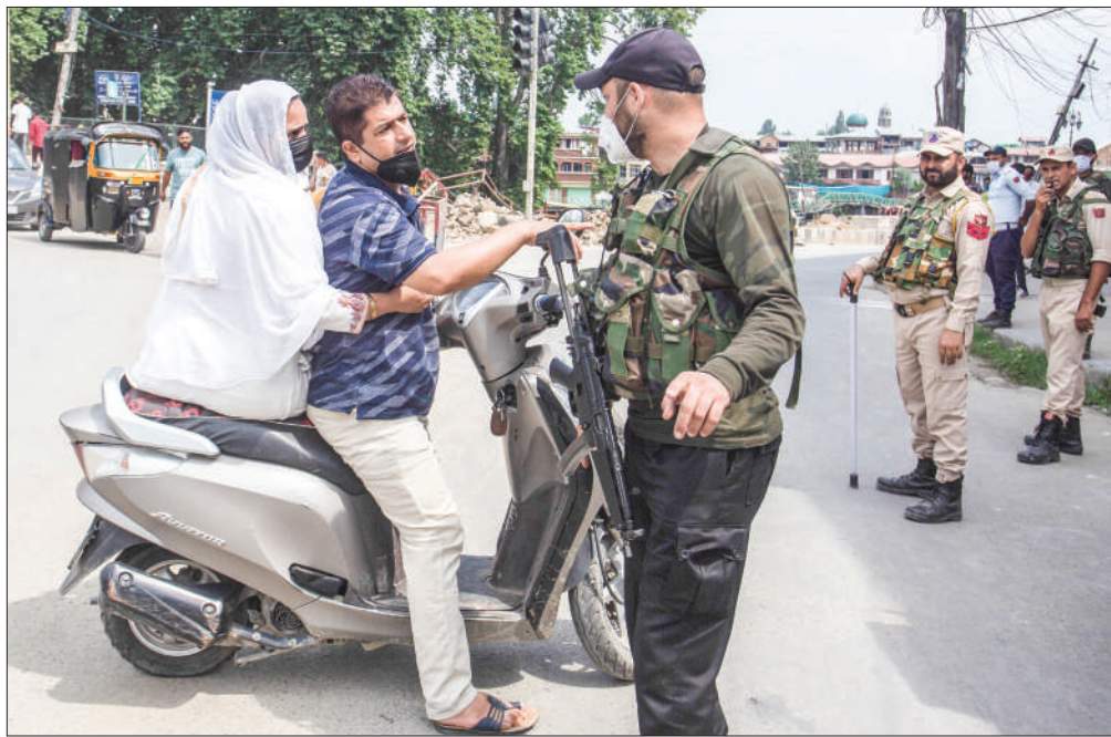
A scooterist is stopped by guards at Dalgate as Boulevard has been closed for public traffic for four days beginning Sunday as part of security bandobast for President Kovind's stay here.

SRINAGAR: Police on Sunday recovered four Improvised Explosive Devices (IEDs) during a cordon and search operation (CASO) in Kupwara district. The four IEDs concealed under a boulder were found by a search team of police and army's 41RR in Nadernagh village of Avoora in the north Kashmir district on Sunday, officials said. They said a Bomb Disposal Squad has reached the spot to defuse the explosive devices.