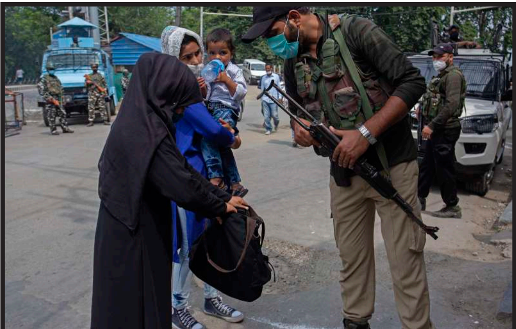
: A policeman checks the bag of a woman in Srinagar on Sunday.

The Deputy Commissioner said that the aim of conducting such activities is to enhance synergy, interaction and coordination between the civil and military agencies and these events provide opportunities for deliberation on important issues of mutual interest impacting security and development of the region.