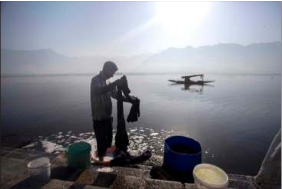
CLEANING AGENT: A man washing clothes at the ghats of Dargah Hazratbal on Wednesday.