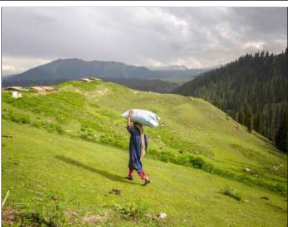
COUNTRY LIFE: A woman making her way through the meadow of Tosa Maidan in Central Kashmir's Budgam district.

The locals spotted his body and informed police. Police have taken cognisance of the incident and started investigations.