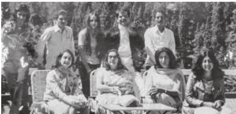
Dilip Kumar along with Saira Bano with their Kashmir host in 1975.

A rotary-dial telephone rang the Rather residence of Dalgate amid the political rumblings of 1975. Srinagar was full of speculations and fearing political tensions, many high-end tourists had cancelled their bookings. But that call would confirm one quiet arrival in Gulmarg. The caller sounded akin to a quint-essential Kashmiri: "Please come back to Gulmarg. You're required to host Dilip Kumar and Saira Banu." Once the Dalgate man reached Gulmarg, he got introduced to a brutal reality that had forced the first Indian superstar and his wife to bow under the shade of the transcendental journey of Kashmir.