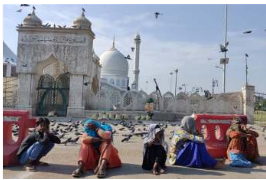
PAUPER PACK: Non-local mendicants covering their faces while begging at the main gate of Kashmir's revered Dargah Hazratbal shrine on Tuesday.