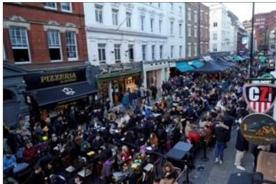
THE UK GOVERNMENT is expected to lift most COVID-19 restrictions in the country in two weeks